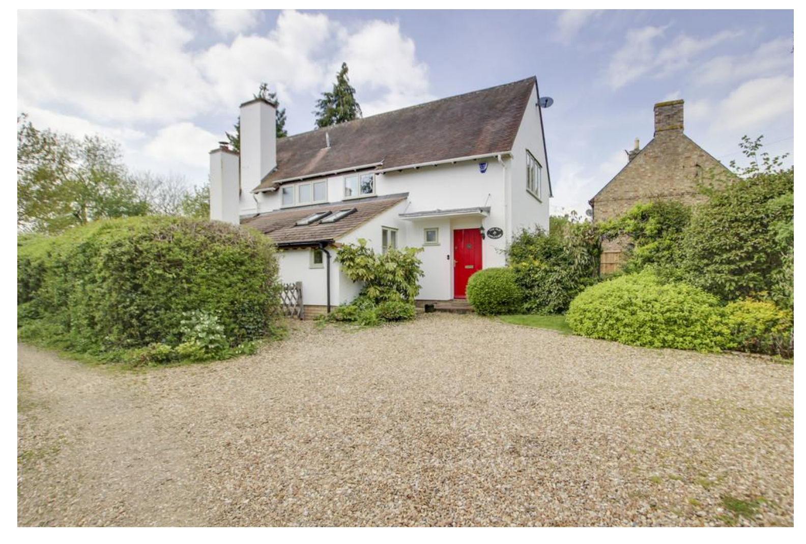
26 High Street, Croxton, St Neots, PE19 6SX