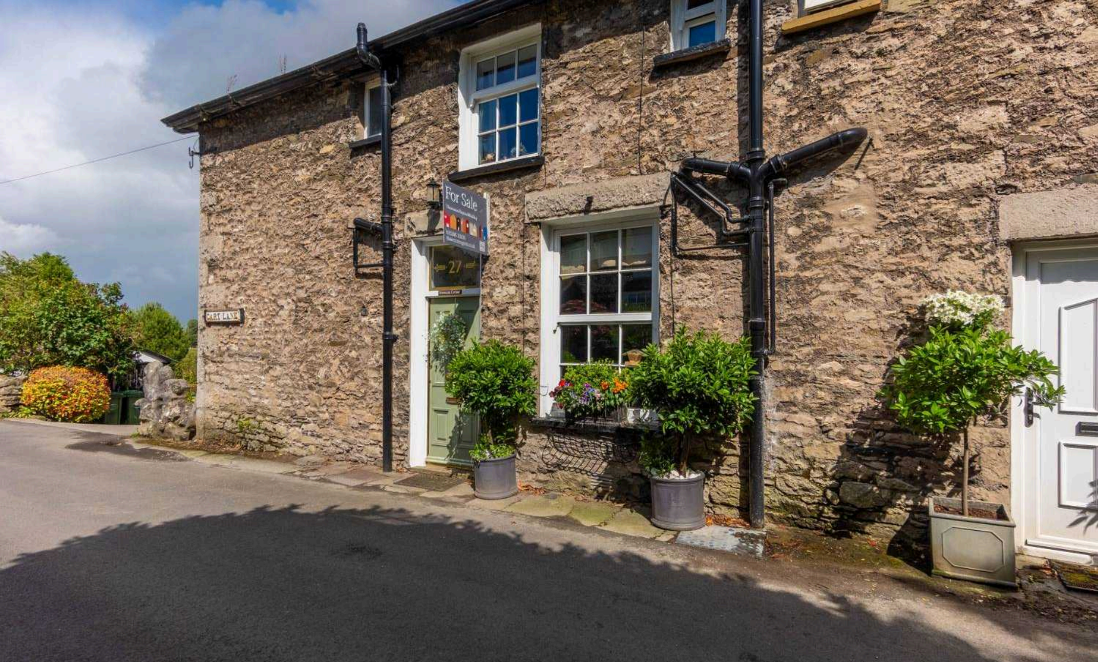
27 Cart Lane, Grange-Over-Sands £320,000