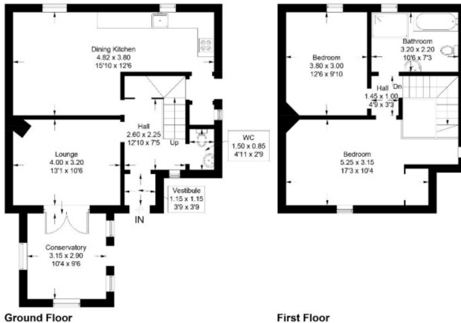
Illustration for identification purposes only, measurements are approximate, not to scale. floorplans.uketch.com © (ID1088644)

Approximate Gross Internal Area = 103.2 sq m / 1111 sq ft