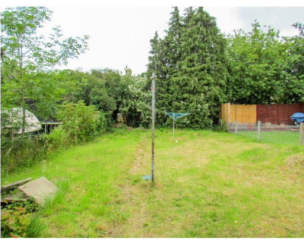
The Chase, Guildford, Surrey, GU2 7UB