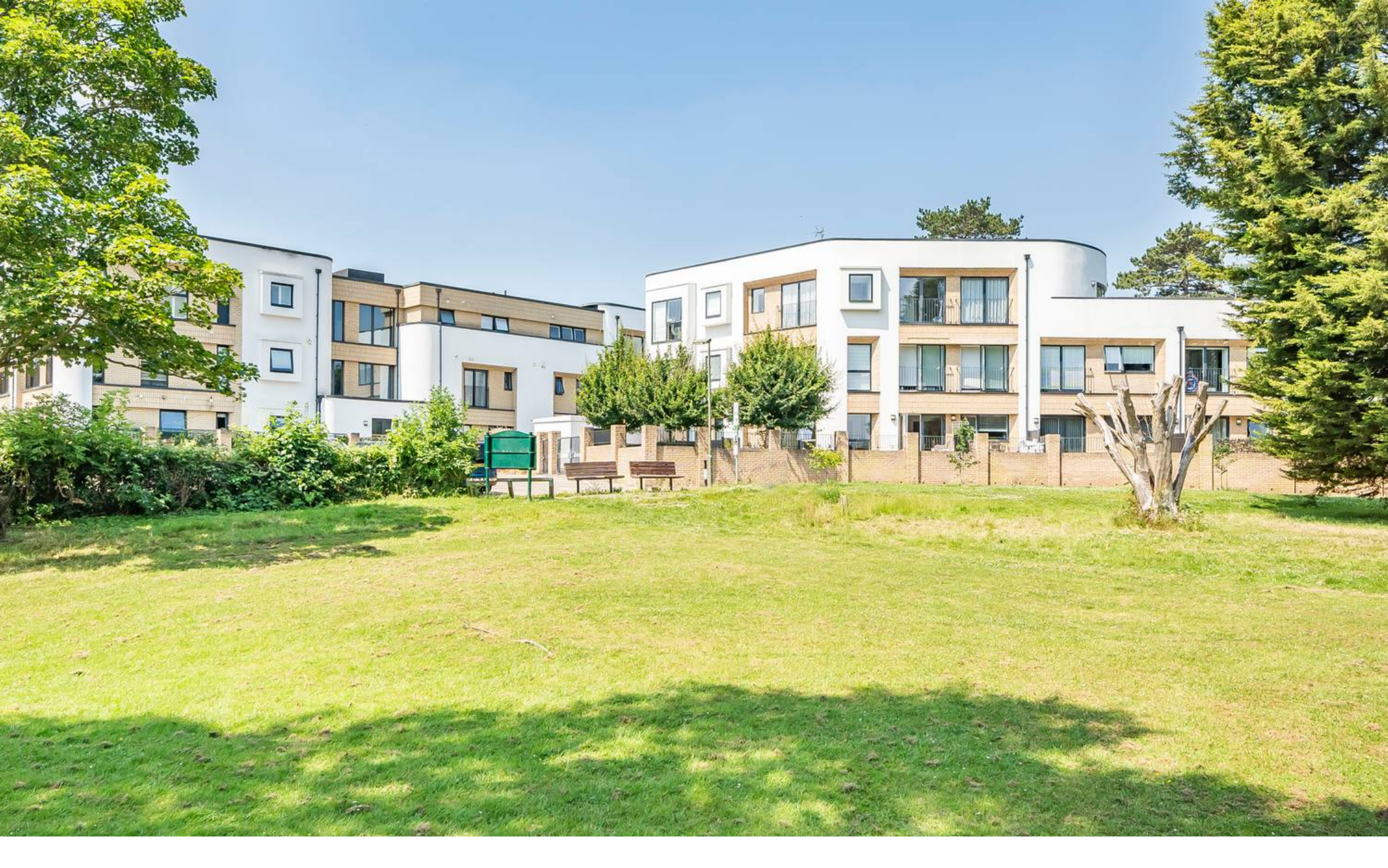
Flat 18, Oaks View Court Lane, Epsom