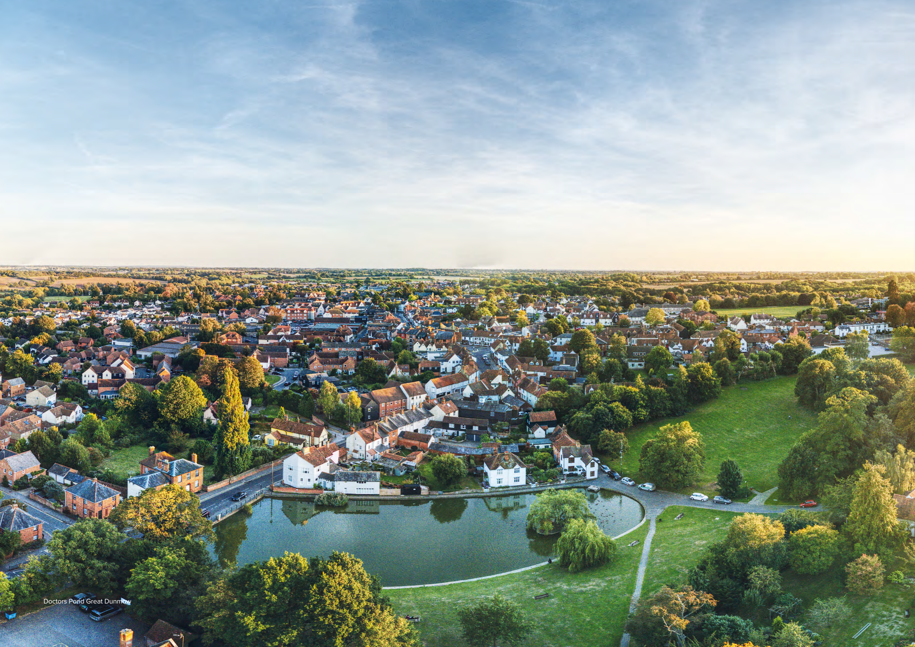
Doctors Pond Great Dunmow