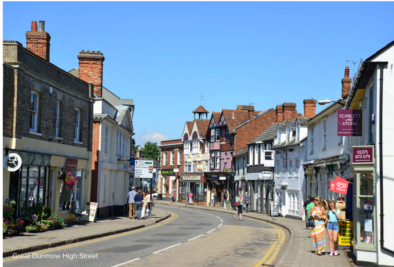
Great Dunmow High Street

Further afield, Great Dunmow is surrounded by countryside making this one of the prettiest parts of Essex. Finchingfield, one of the most picturesque villages in Essex, is just 10 miles away. The historic medieval market town of Saffron Walden and Chelmsford city are just a brief 20 minute drive away. Despite Great Dunmow being centrally located to the aforementioned towns it retains a rural feel. The main road connections to Stansted Airport, London and neighbouring Chelmsford ensure that cosmopolitan dining and shopping areas are all within easy reach.