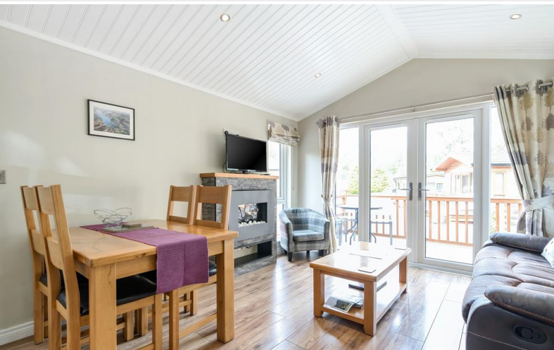
Open Plan Living