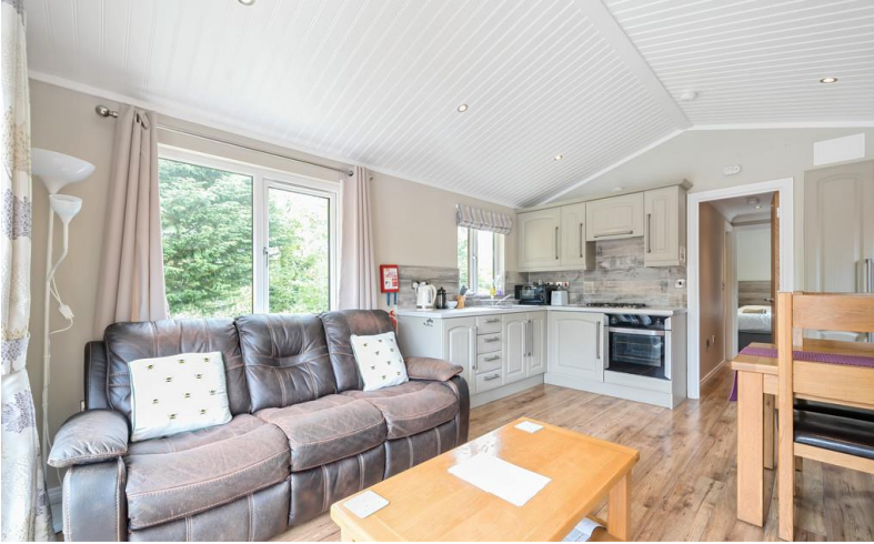
Open Plan Living