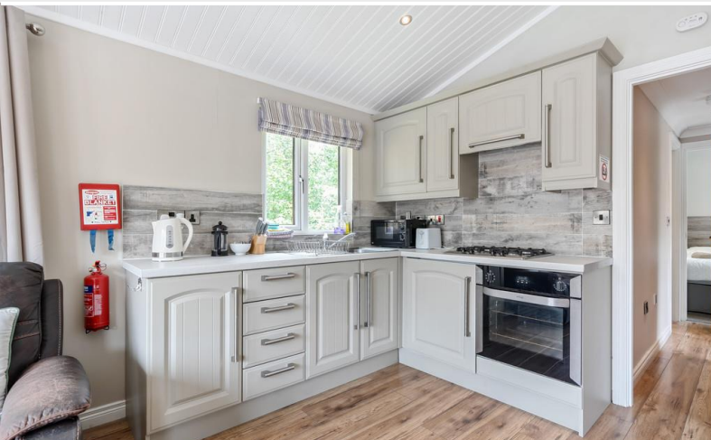
Open Plan Living