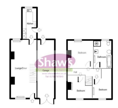
Whilst every attempt has been made to be resure the accusacy of the floor plan contained how, money accusance that do down, windows, comms and any other items are approximate, and no expossability in these froit age reco