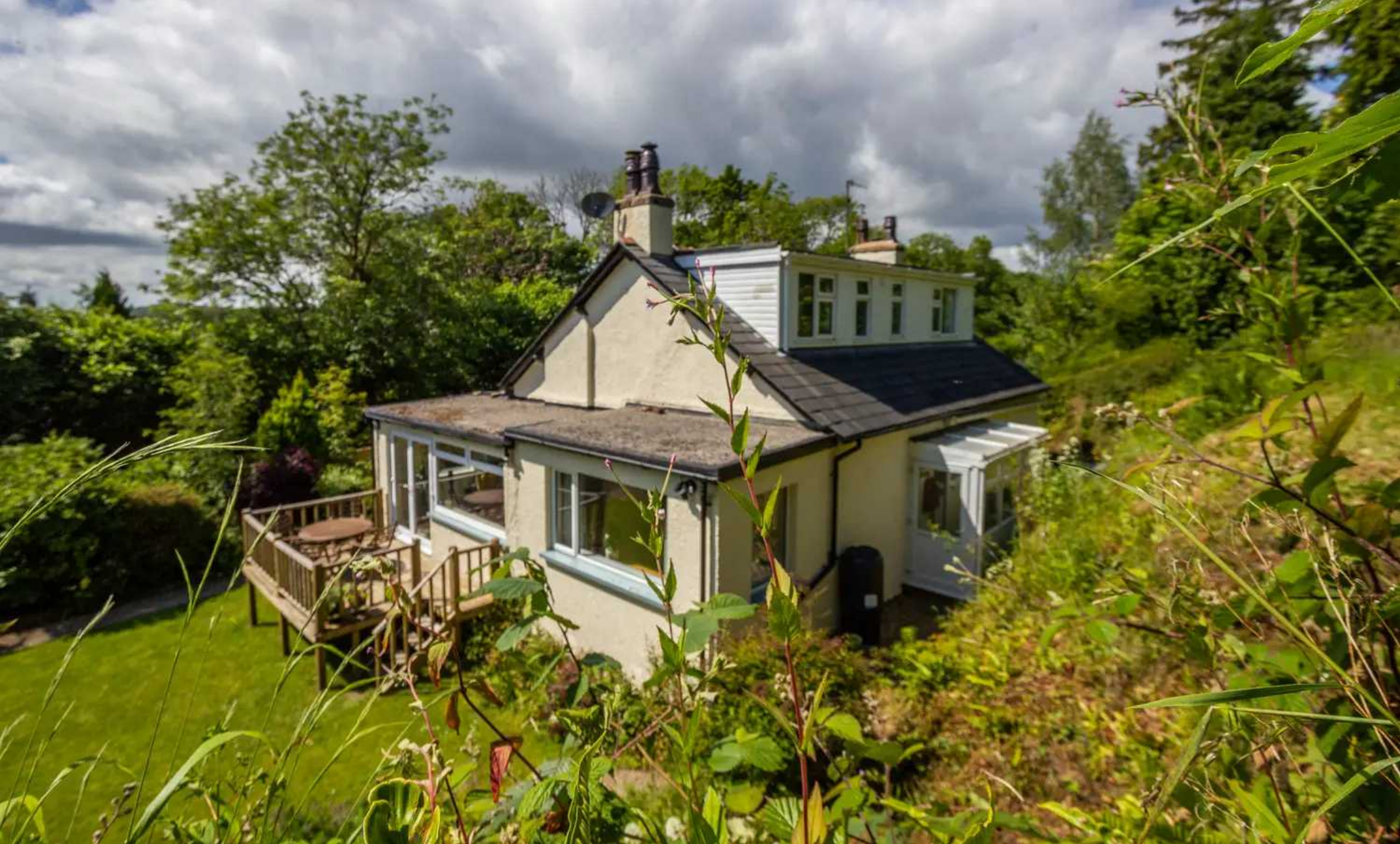
Haggwood Hags Lane, Cartmel £600,000