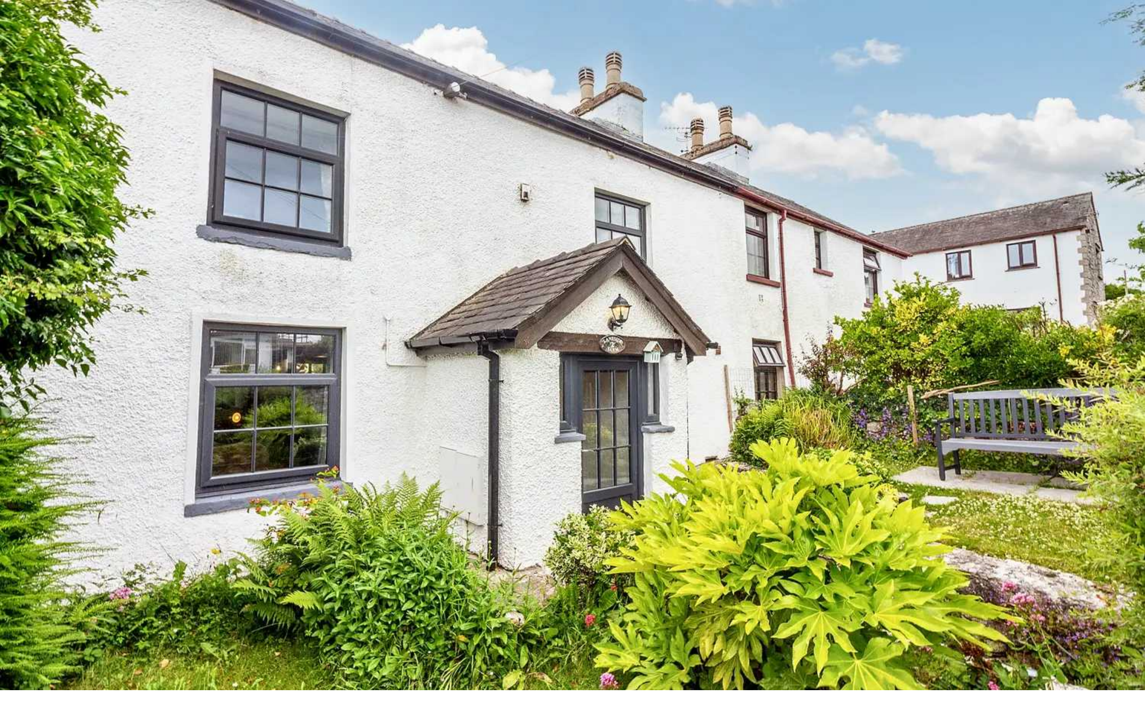
2 Laneside Farm Kirkhead Road, Grange-Over-Sands £375,000