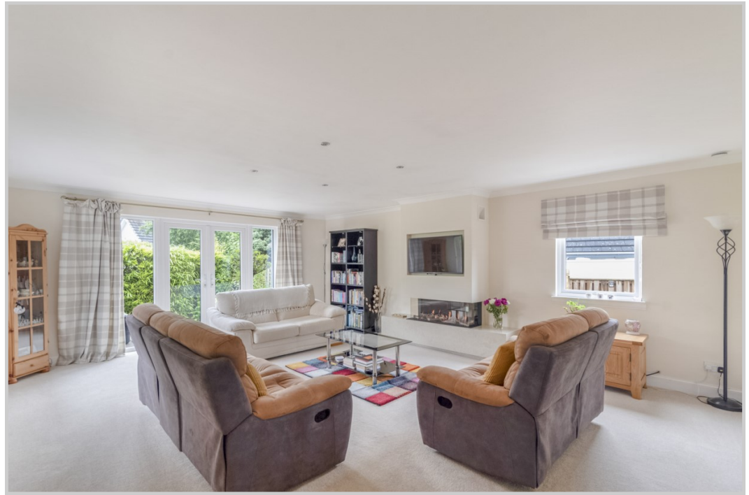
These particulars are believed to be correct, but their accuracy is not guaranteed and they do not form part of any contract. All measurements are approximate only.