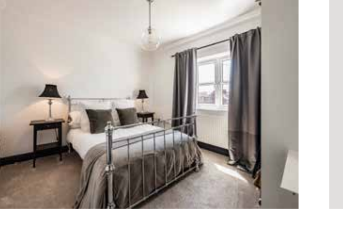
...bedrooms are served by a renovated family bathroom...