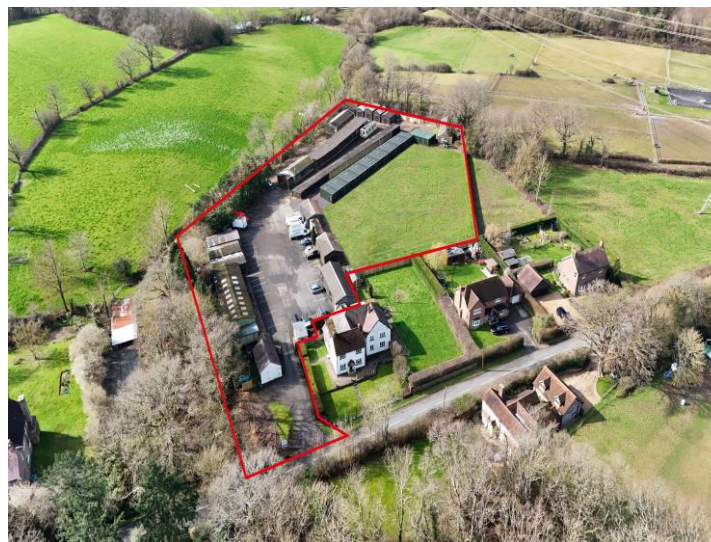
ANSELLS YARD, WISBOROUGH GREEN TOP SHED