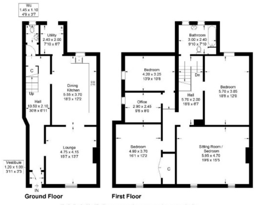
Illustration for identification purposes only, measurements are approximate, not to scale. floorplansUsketch.com © (ID1099053)

Approximate Gross Internal Area = 186.2 sq m / 2004 sq ft