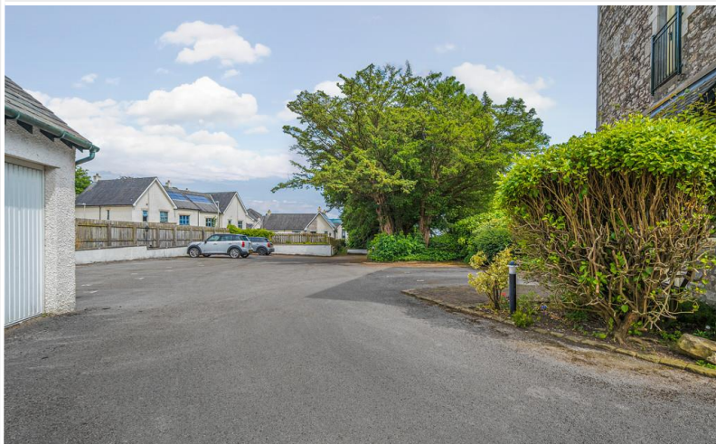
Car Park with designated spaces