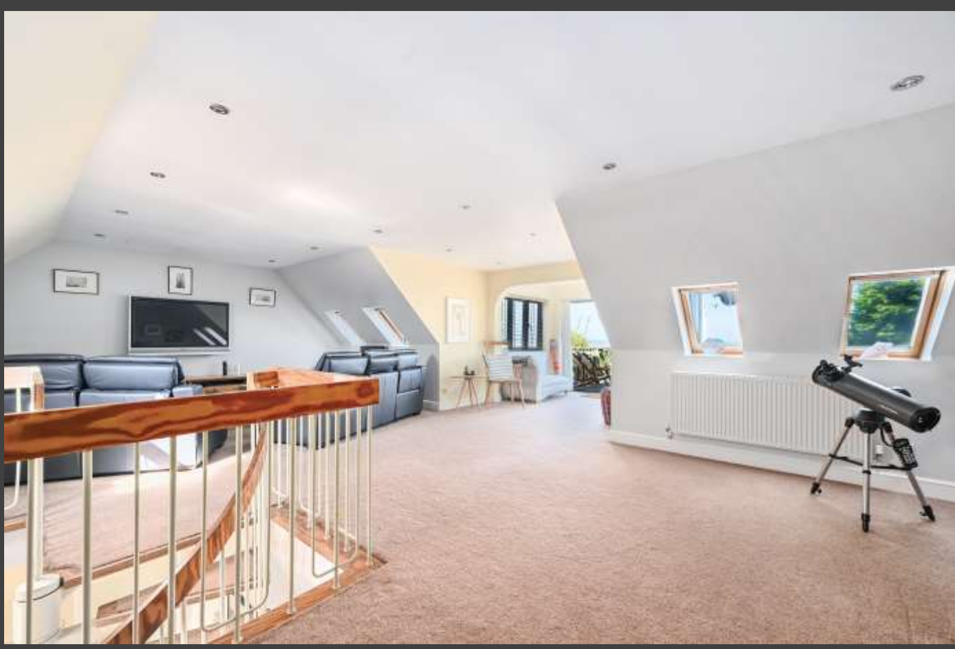
A detached two bedroom coastal house with direct beach access over the sand dunes onto the beach, enjoying far reaching sea views over the English Channel with France in the distance.

Entrance lobby • Open plan kitchen/dining area with spiral staircase to first floor • Inner hallway • Bedroom I with en-suite bathroom Bedroom 2 • Family shower room • Side lobby (Off the kitchen with access to front and rear gardens) First floor open plan living room opening out onto an area of raised decking with sea views beyond • Gas heating • Double glazing Outside: driveway providing off road parking • Detached single garage