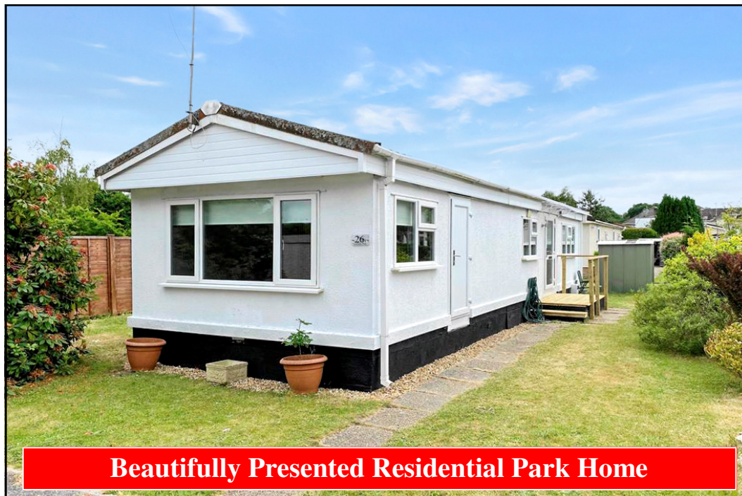
Beautifully Presented Residential Park Home

26 Gladelands Park, Ringwood Road, Ferndown, Dorset. BH22 9BW