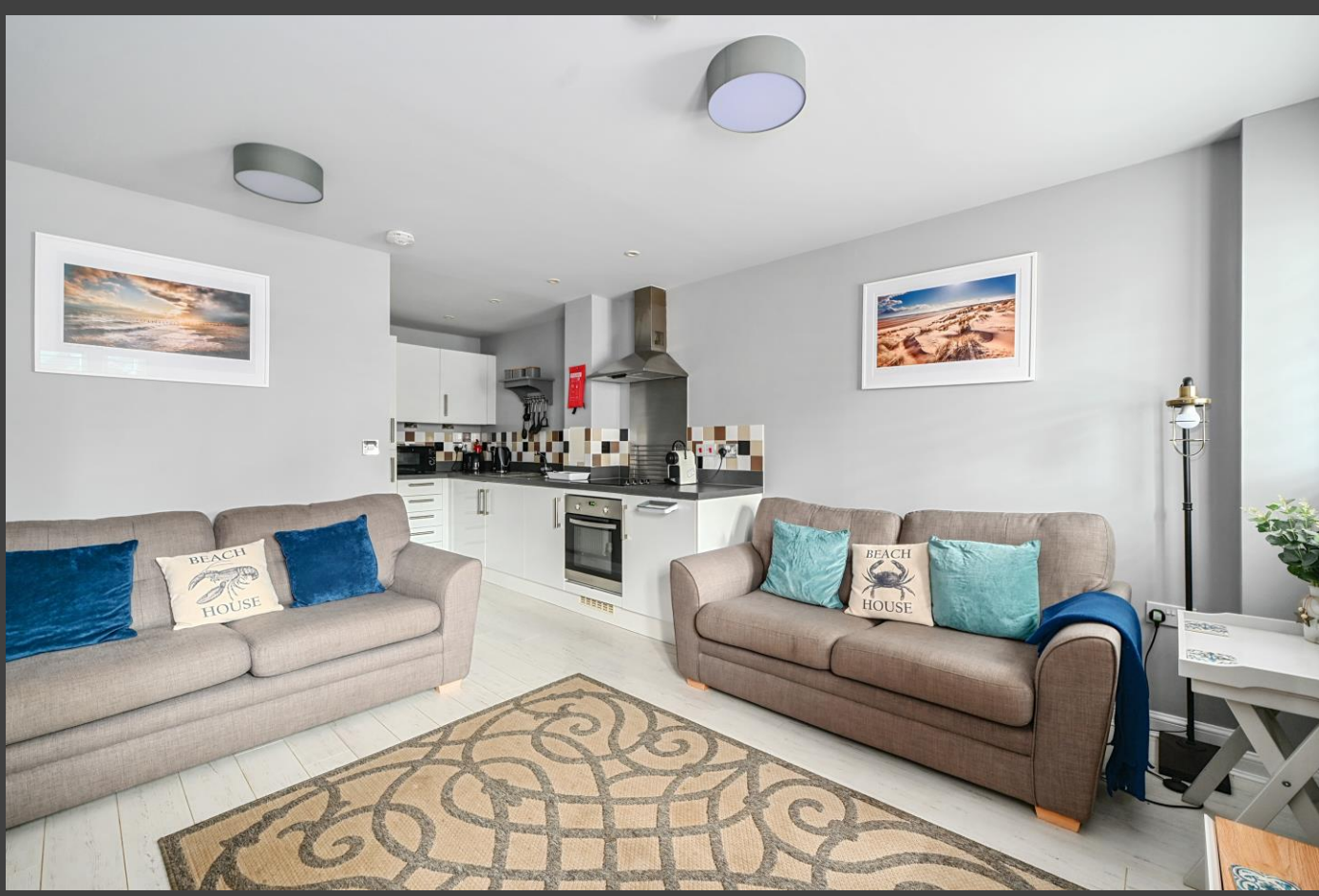
A one bedroom ground and first floor maisonette within the popular Whitesands development situated a few hundred yards from the vast stretch of Camber Sands beach.

Entrance hall • Open plan living room/kitchen • Cloakroom First floor landing • Double bedroom with en suite dressing room and en suite bathroom • Additional shower room Gas heating LPG • Double glazing • One allocated parking space • EPC rating C