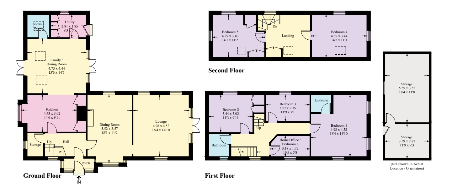
Illustration for identification purposes only, measurements are approximate, not to scale. floorplansUsketch.com © (ID1097426)