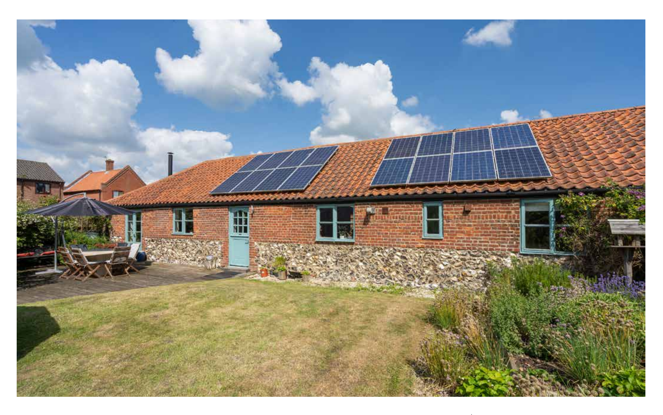
4 Street Farm Barns Catfield | Norfolk | NR29 5HP