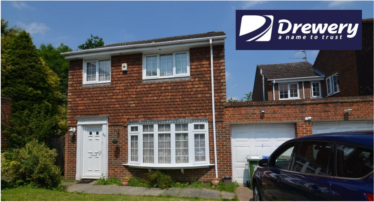
20 Austral Close, Sidcup, Kent, DA15 7LE £2,100 pcm