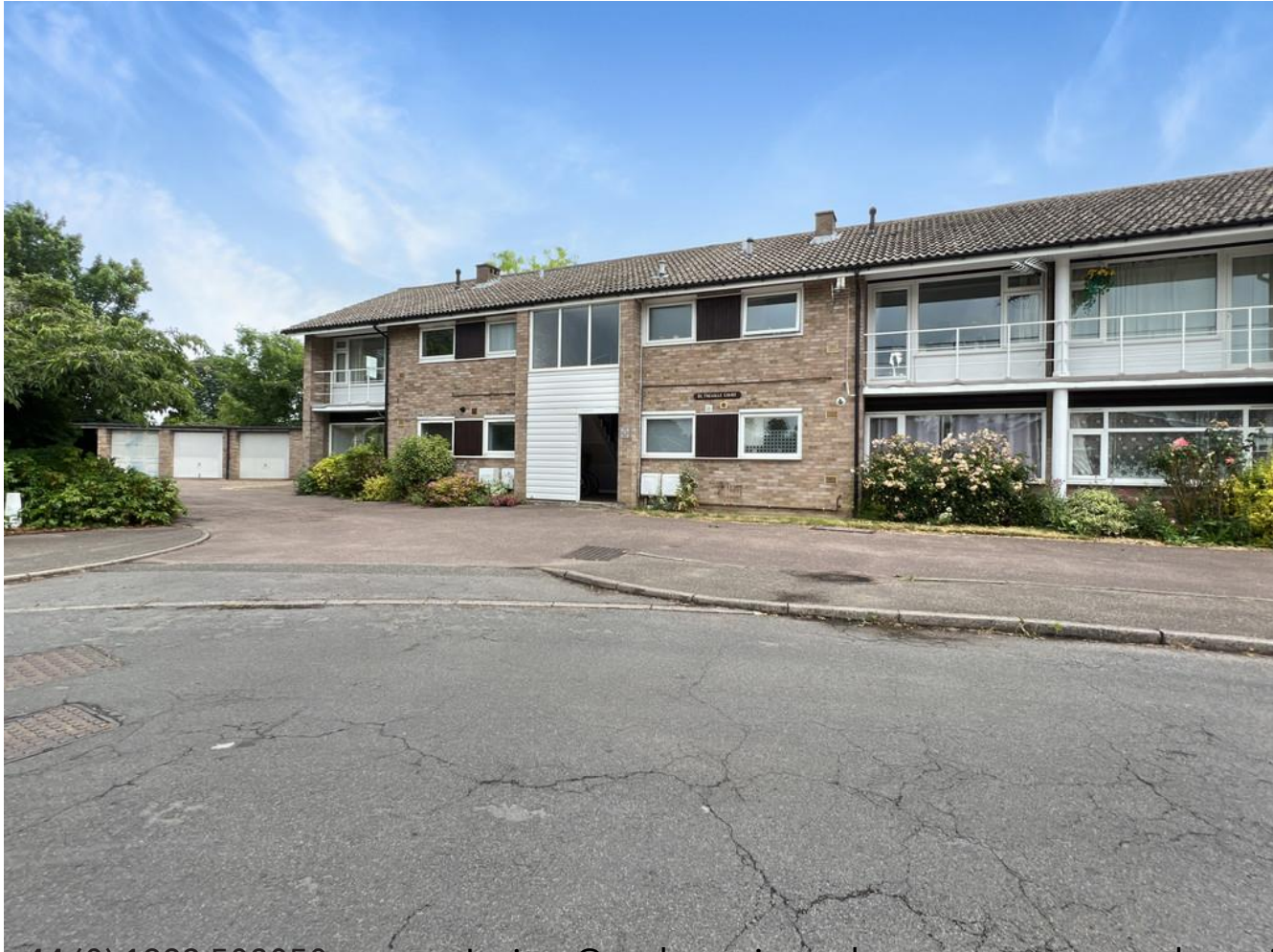
De Freville Court, Shelford