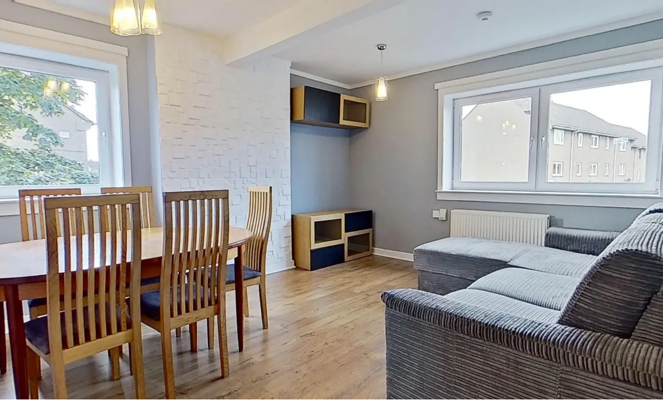
149/2 Wester Drylaw Drive, Edinburgh Offers Over £150,000