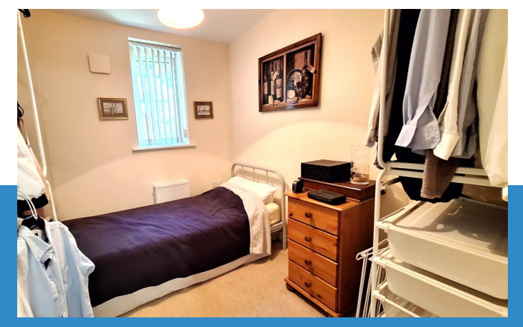
Maxwell Brown, 45 Ipswich Street, Stowmarket, Suffolk, IP14 1AH