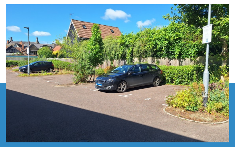
Maxwell Brown, 45 Ipswich Street, Stowmarket, Suffolk, IP14 1AH

A 2015 built 2 bedroomed First Floor flat situated in a purpose built block on this pleasant development within the well served small town of Needham Market. The property has the benefits of communal gardens, allocated car parking, gas fired central heating, double glazed windows, private hall, lounge, fitted kitchen, 2 bedrooms and bathroom. Ideal first or investment property, with a potential rental of Approx £875pcm.