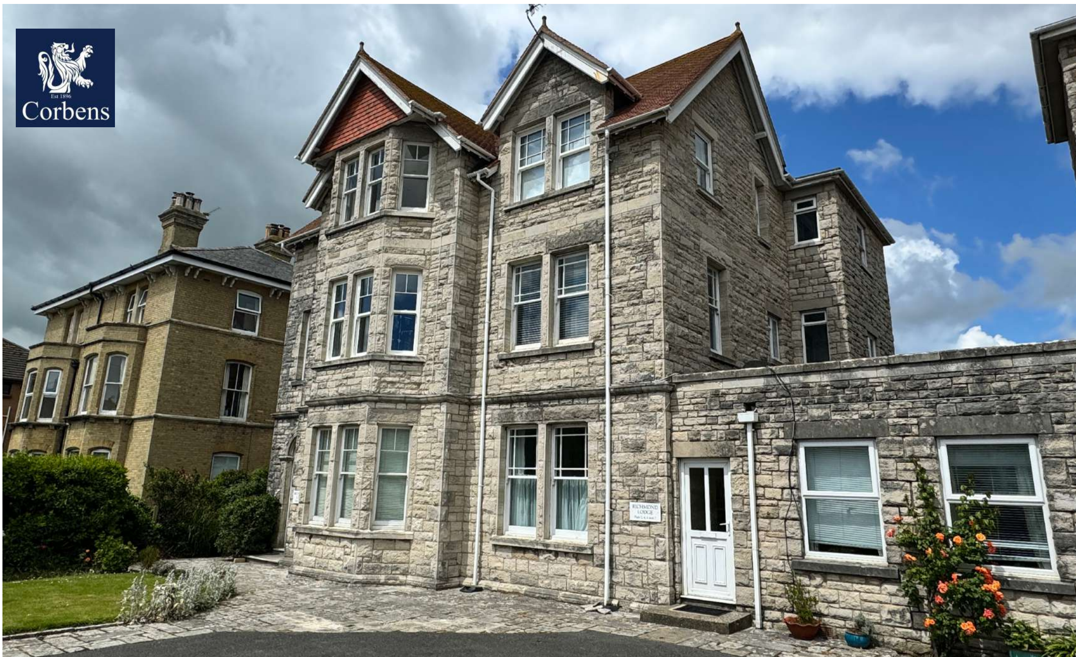
5 RICHMOND LODGE, VICTORIA AVENUE, SWANAGE £235,000 Shared Freehold