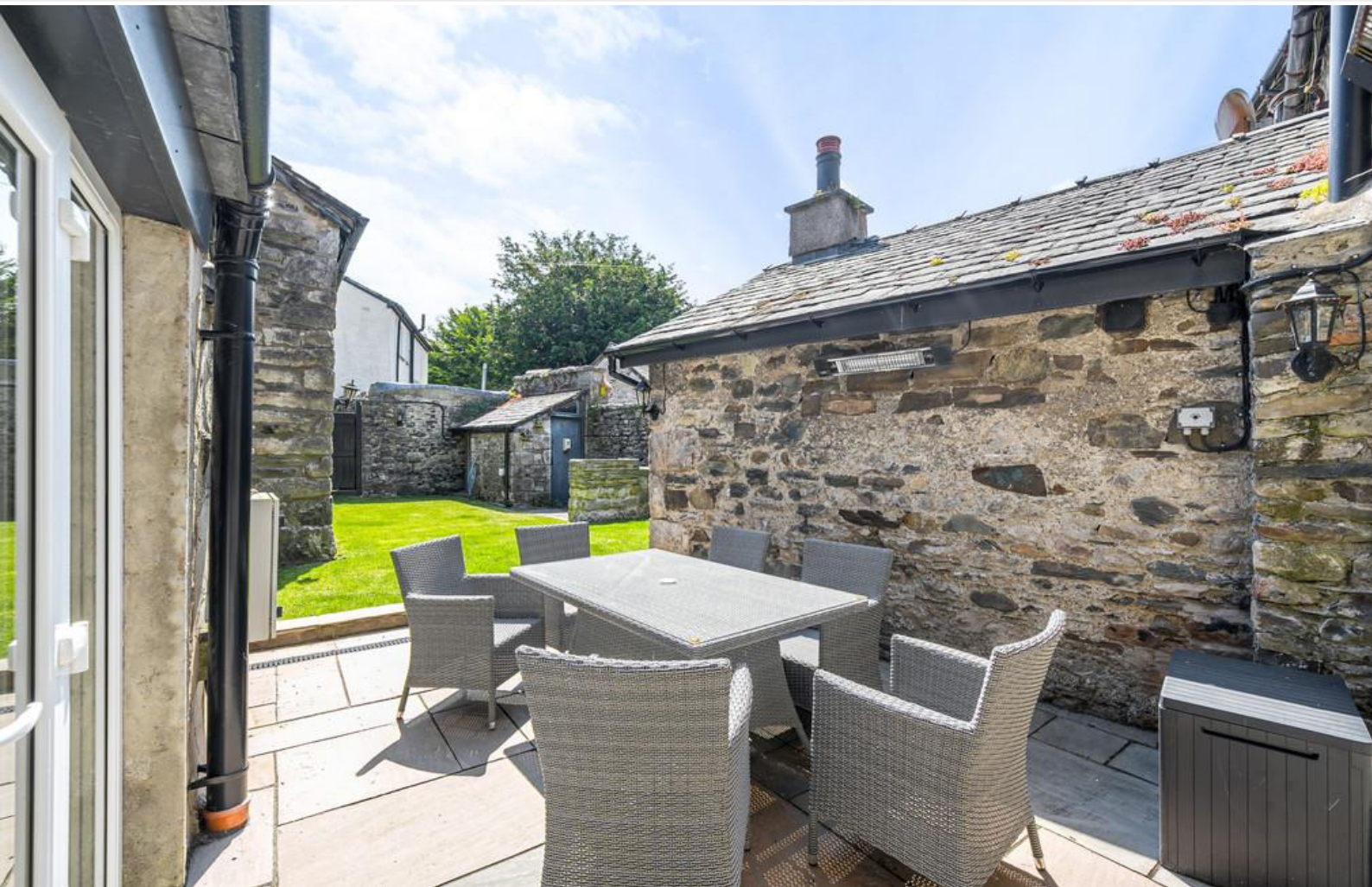
Patio and Garden