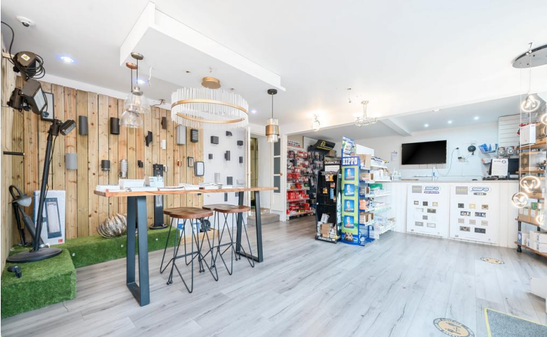
Over Beck Shop Front/Showroom