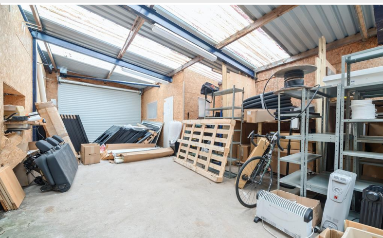
Over Beck Garage/Workshop