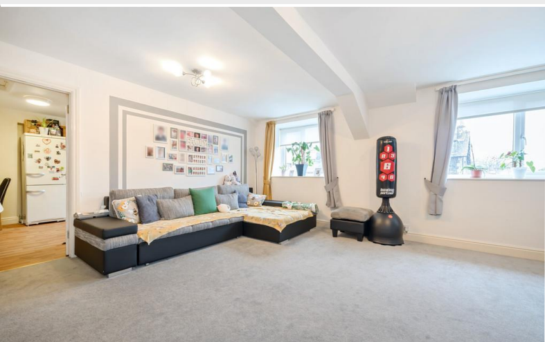
Above Beck Living Room

Description: A great investment in Windermere of a substantial 4 bedroomed first floor flat with large retail shop beneath with excellent garage, workshop area and off road parking all currently let out creating an income of £950.00pcm for the flat and £2,732.00pcm for the ground floor premises.