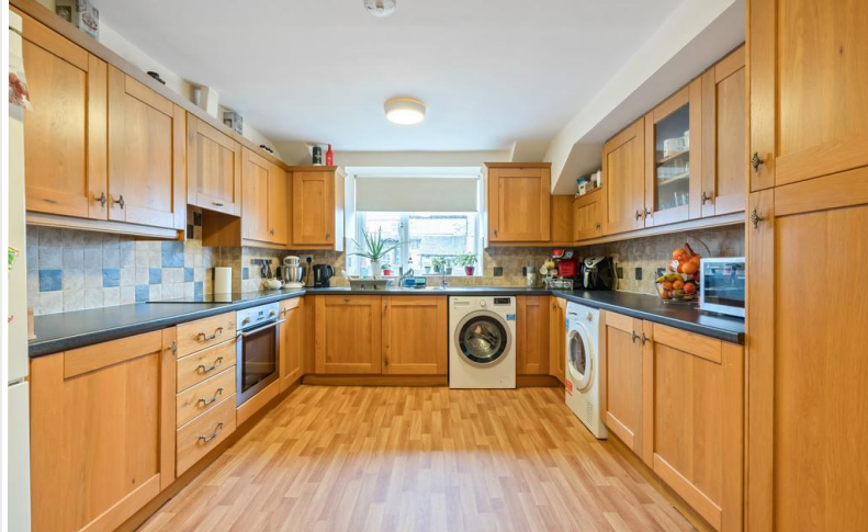
Above Beck Kitchen

Notes: *Checked on https://www.openreach.com/ 8th April 2024 - not verified.