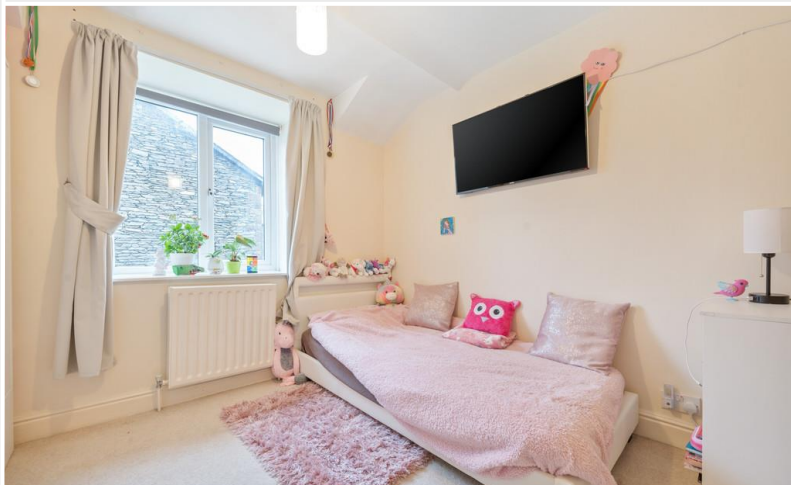
Above Beck Bedroom 2