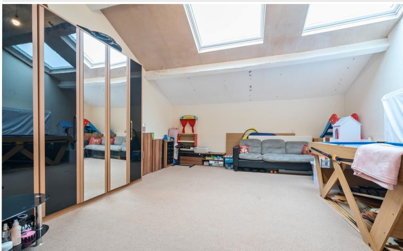
Above Beck Bedroom 4