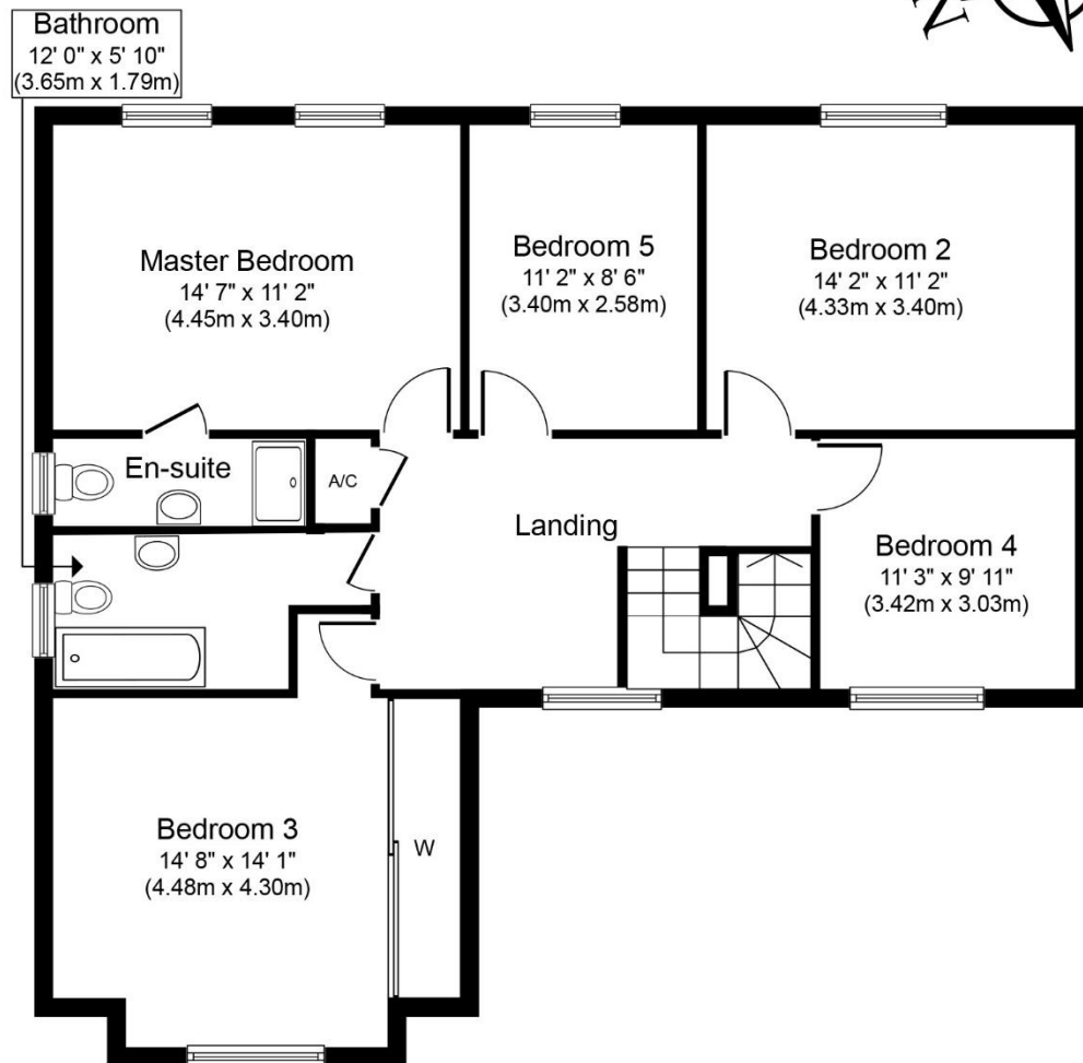
First Floor Approximate Floor Area 930 sq. ft. (86.4 sq. m.)

Whilst every attempt has been made to ensure the accuracy of the floor plan contained here, measurements of doors, windows, rooms and any other items are approximate and no responsibility is taken for any error, omission, or mis-statement. The measurements should not be relied upon for valuation, transaction and/or funding purposes. This plan is for illustrative purposes only and should be used as such by any prospective purchaser or tenant.