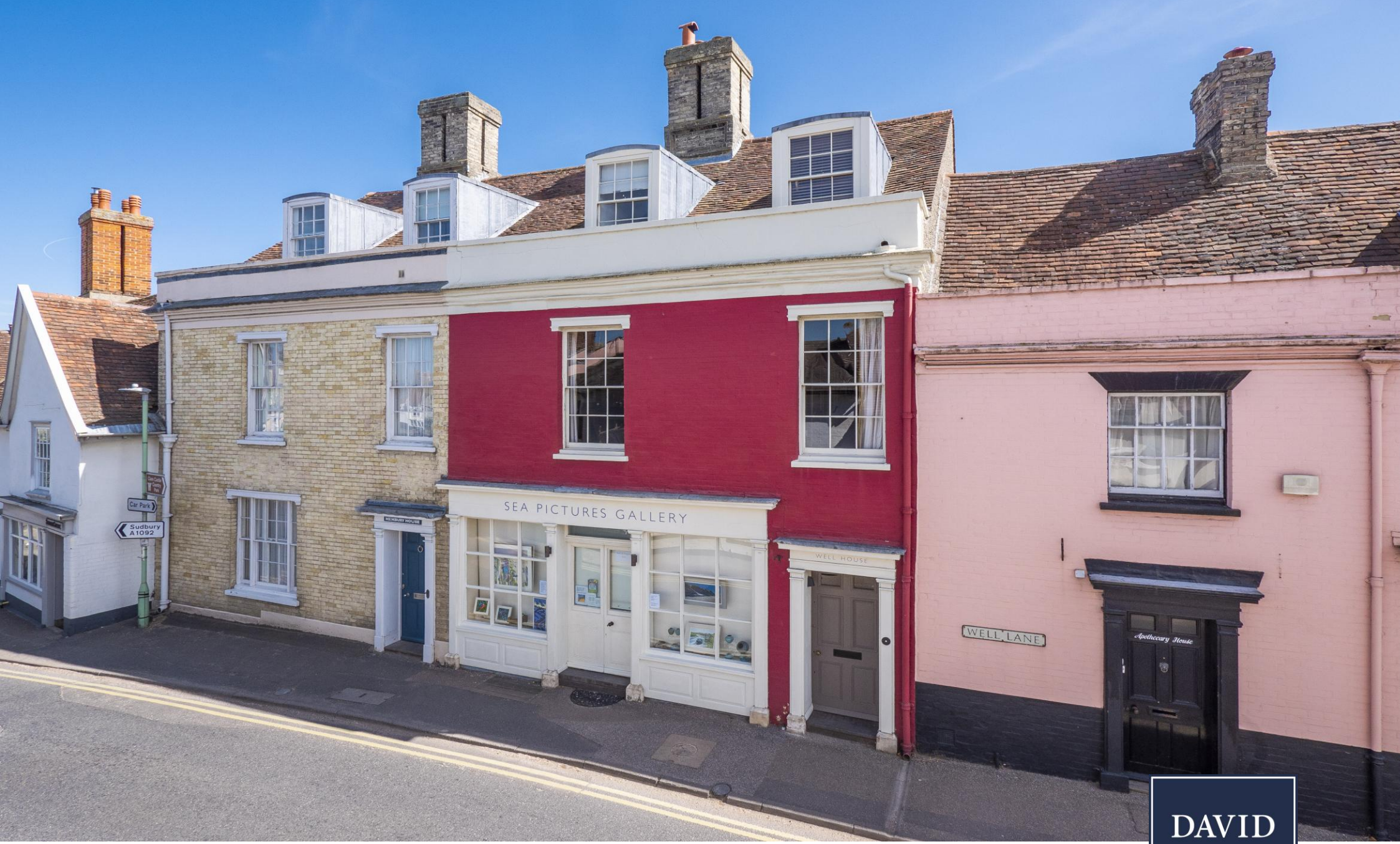
Well House Clare, Suffolk