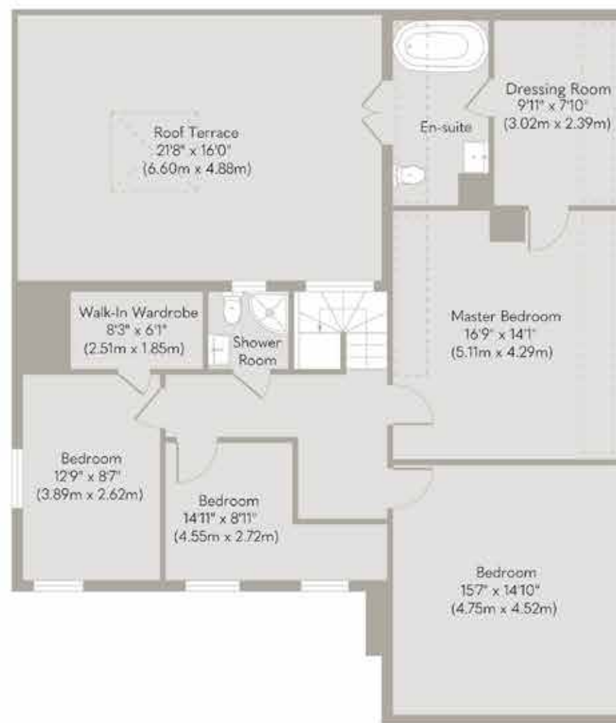
First Floor Approximate Floor Area 1013 sq. ft (94.14 sq. m)