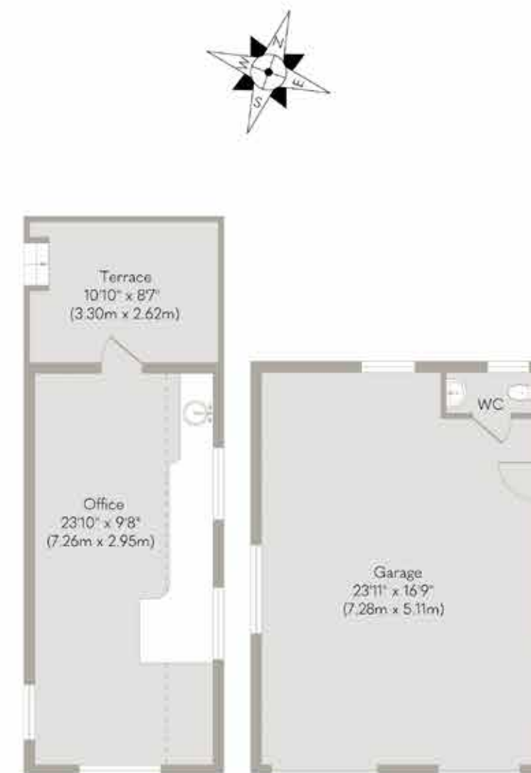
Garage Approximate Floor Area 658 sq. ft (61.16 sq. m)

Whilst every attempt has been made to ensure the accuracy of the floor plan contained here, measurements of doors, windows, rooms and any other items are approximate and no responsibility is taken for any error, omission, or mis-statement. This plan is for illustrative purposes only and should be used as such by any prospective purchaser or tenant. The services, systems and appliances shown have not been tested and no guarantee as to their operability or efficiency can be given. Copyright V360 Ltd 2023 | www.houseviz.com