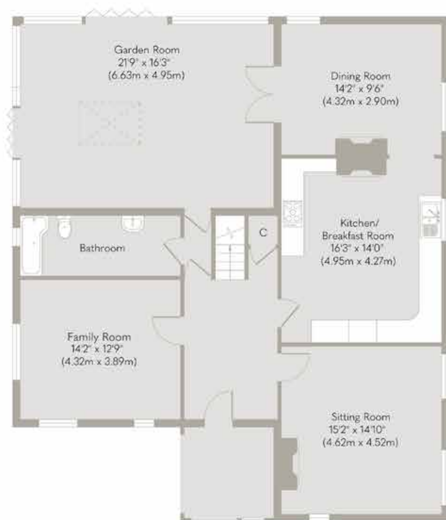
Ground Floor Approximate Floor Area 1419 sq. ft (131.86 sq. m)