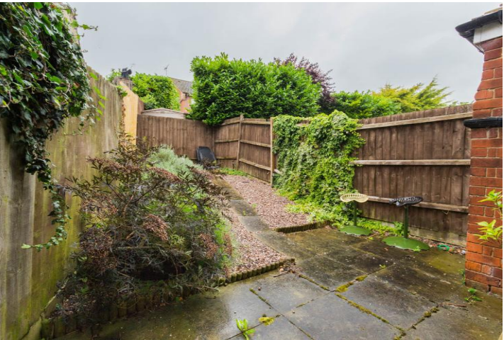
Lime Terrace Irthlingborough NN9 5SJ Freehold Price £185,000

Wellingborough Office 27 Sheep Street Wellingborough Northants NN8 1BS 01933 224400