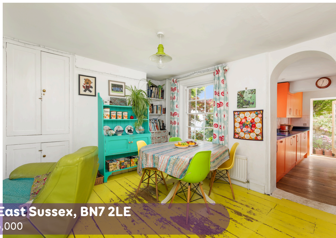
Friars Walk, Lewes, East Sussex, BN7 2LE £685,000