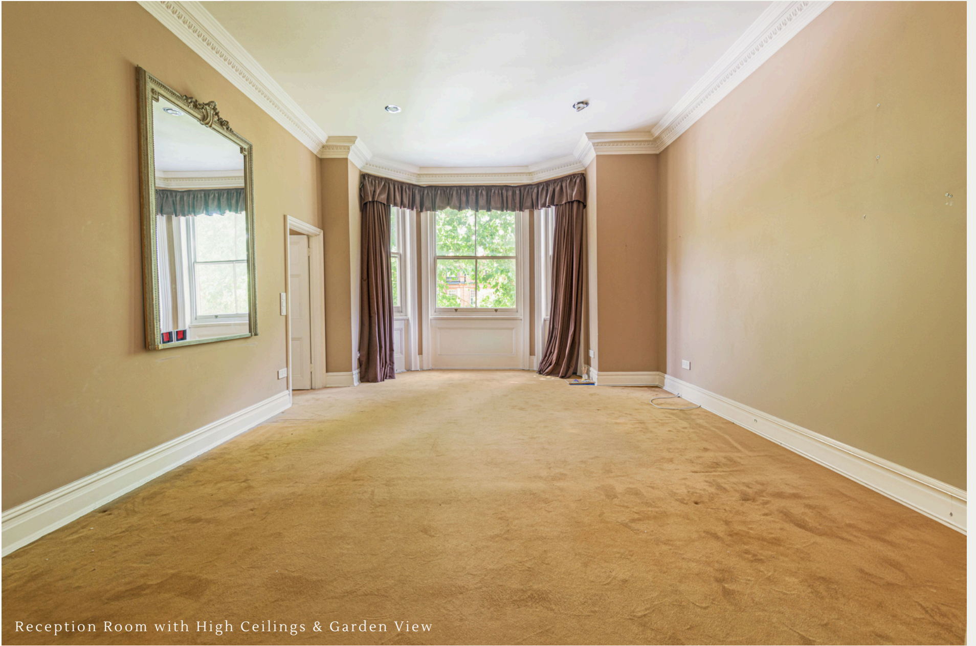
Reception Room with High Ceilings & Garden View