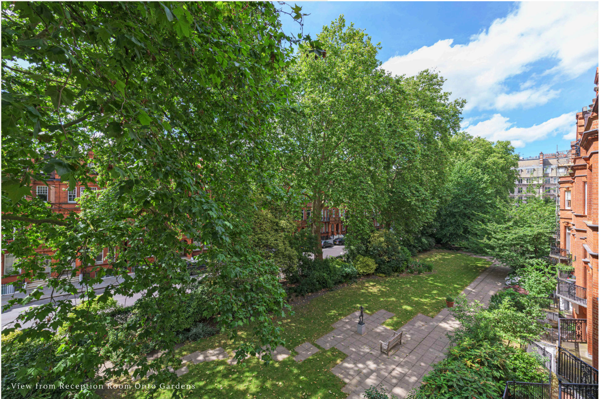
View from Reception Room Onto Gardens