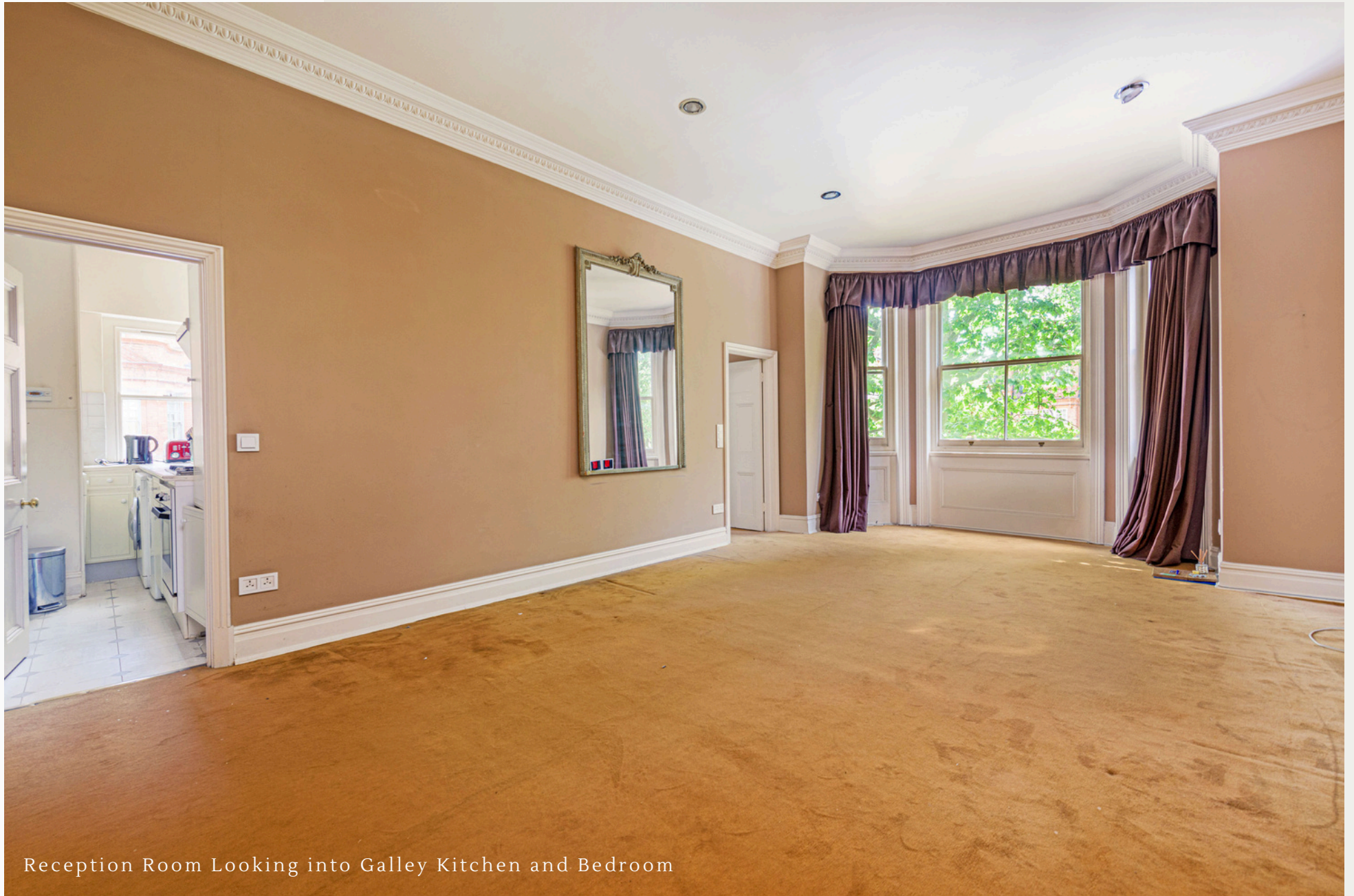
Reception Room Looking into Galley Kitchen and Bedroom