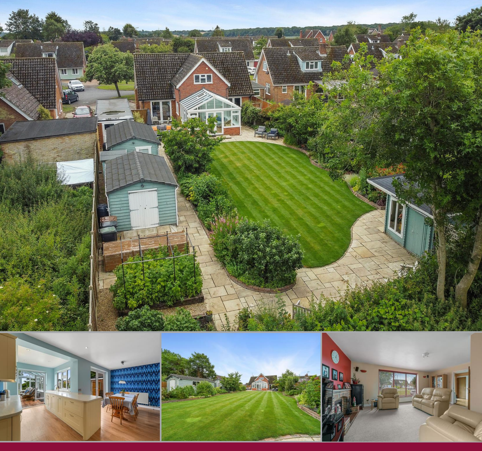
8 North Acres | Willisham | Suffolk | IP8 4SS

Specialist marketing for | Barns | Cottages | Period Properties | Executive Homes | Town Houses | Village Homes