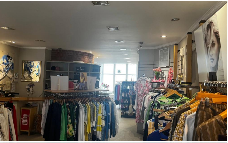
Ground Floor Shop