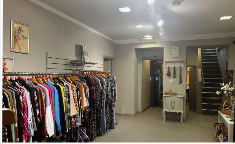
Lower Floor Shop

Broadband: *Checked on https://checker.ofcom.org.uk/01.07.2024 not verified.