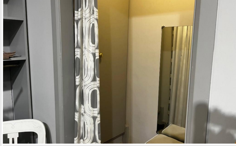
Changing Room Lower Ground Floor