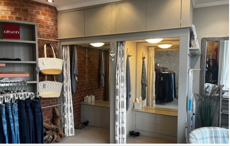
Changing Rooms Ground Floor