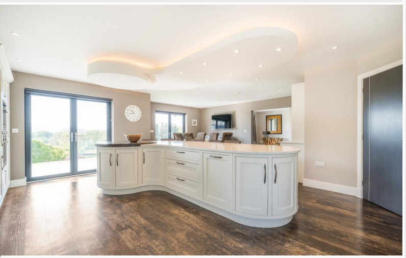
Open Plan Dining Kitchen