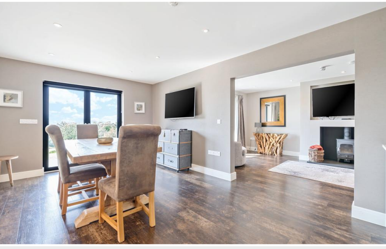
Open Plan Dining Room

Property Overview: Through the large covered porch, step inside to find a stylish open plan dining kitchen, the heart of this stunning home or an excellent holiday let investment. This space has been meticulously designed to cater to modern living, featuring top-of-the-range appliances and luxurious finishes.