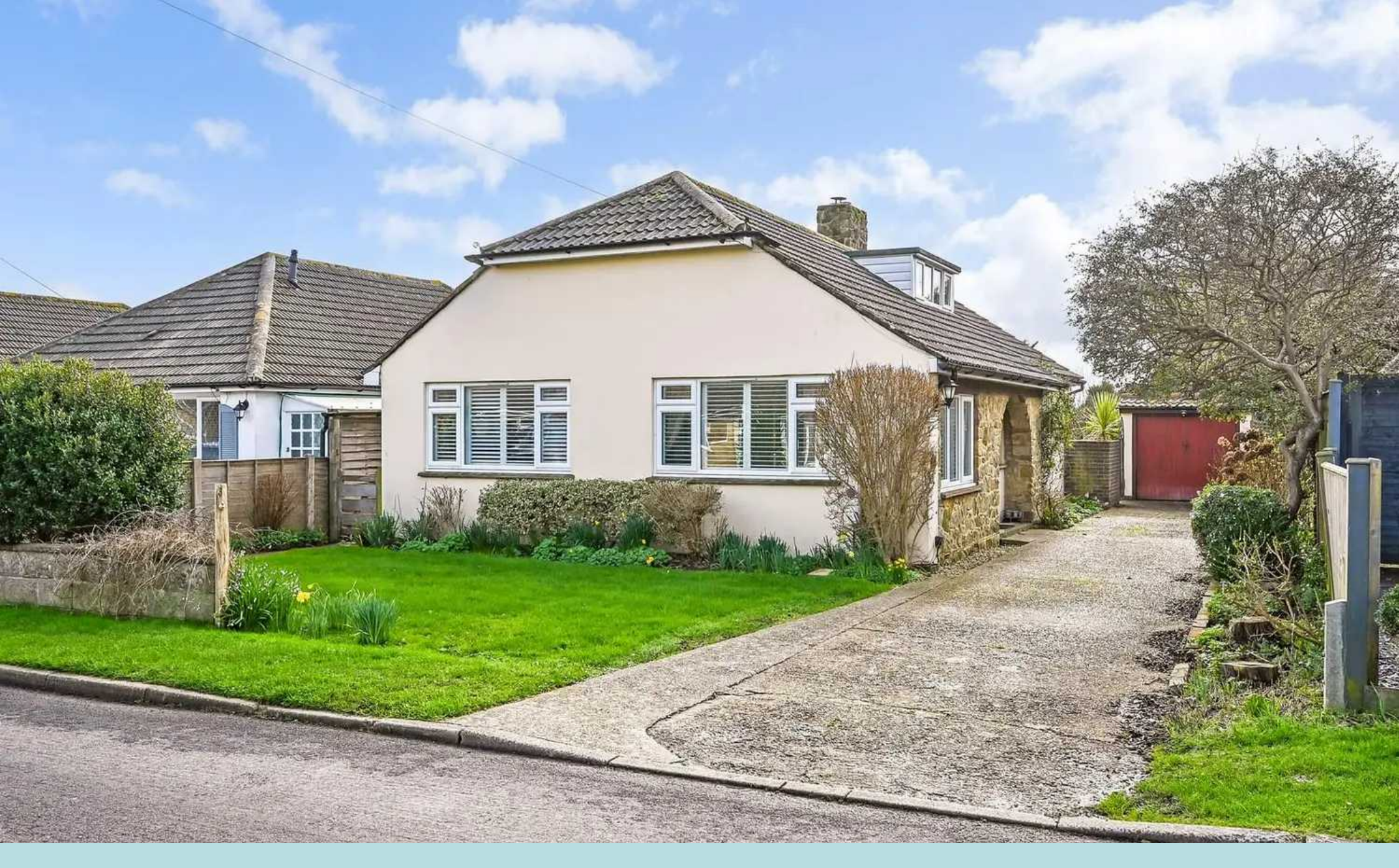
6 Elm Close, Bracklesham Bay Guide Price £600,000