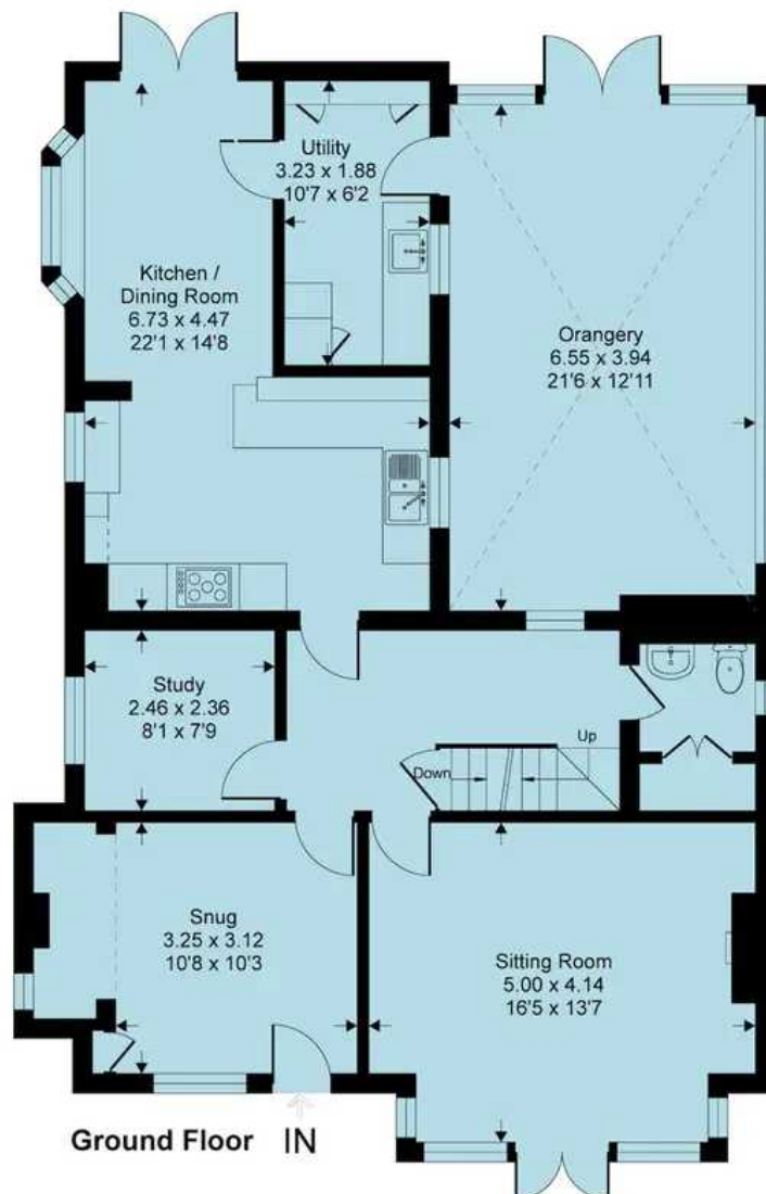
Ground Floor IN