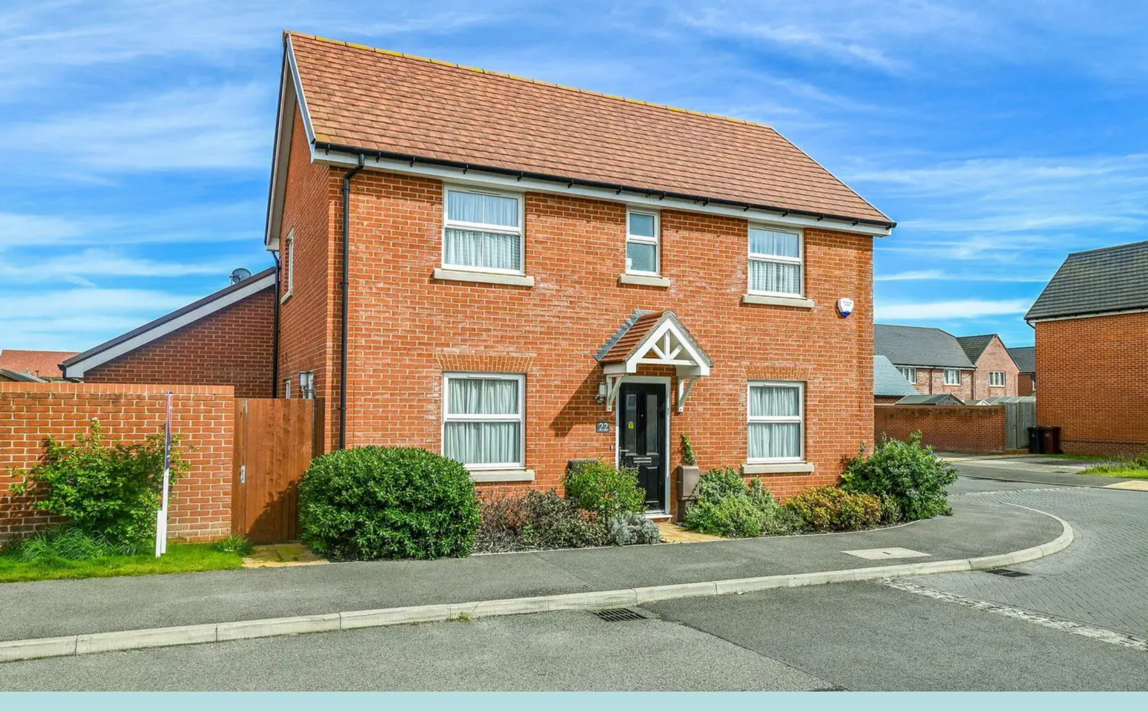
22 Hornbeam Walk, Bracklesham Bay Guide Price £495,000