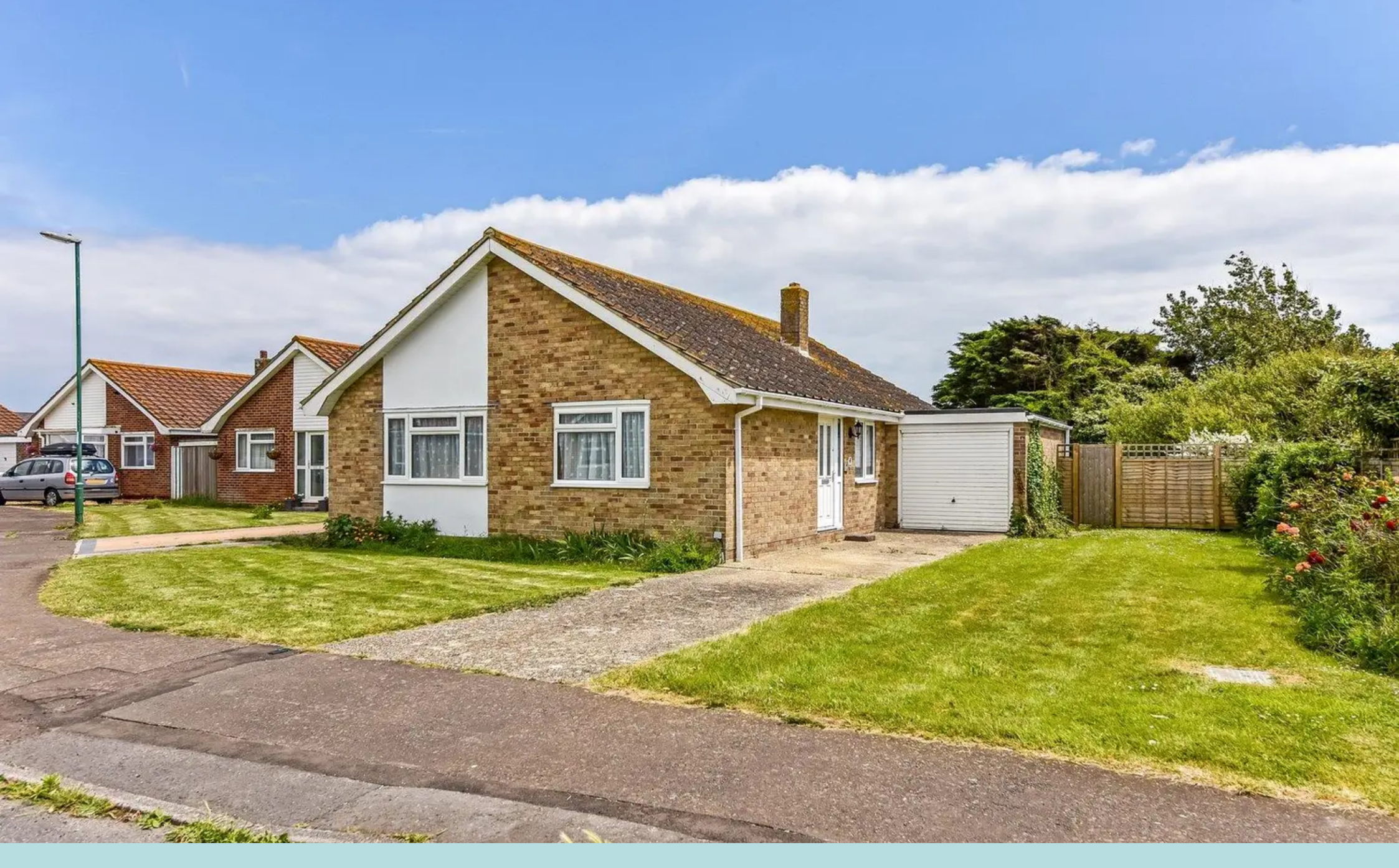
4 Sandringham Close, Bracklesham Bay Guide Price £550,000