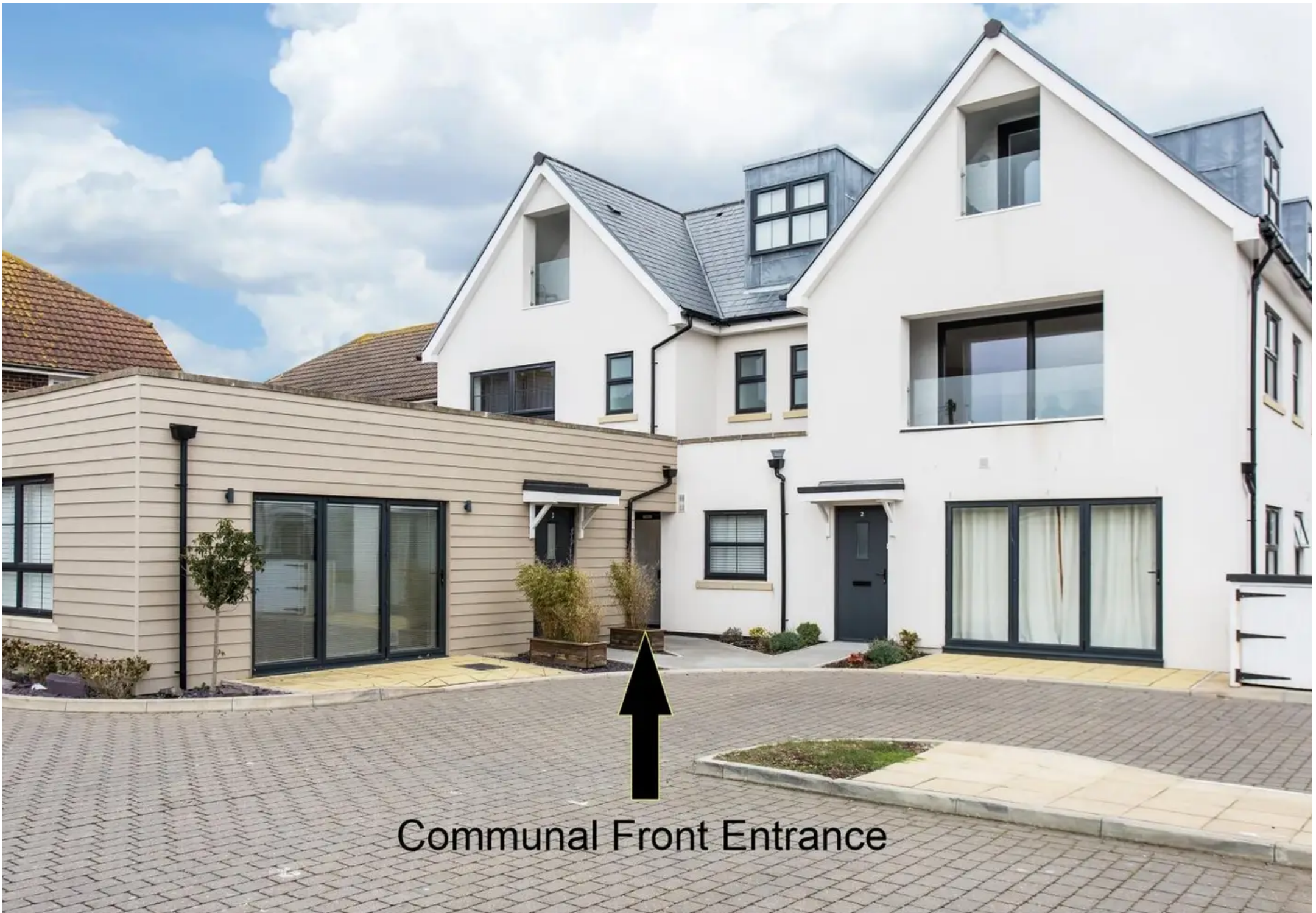
Communal Front Entrance