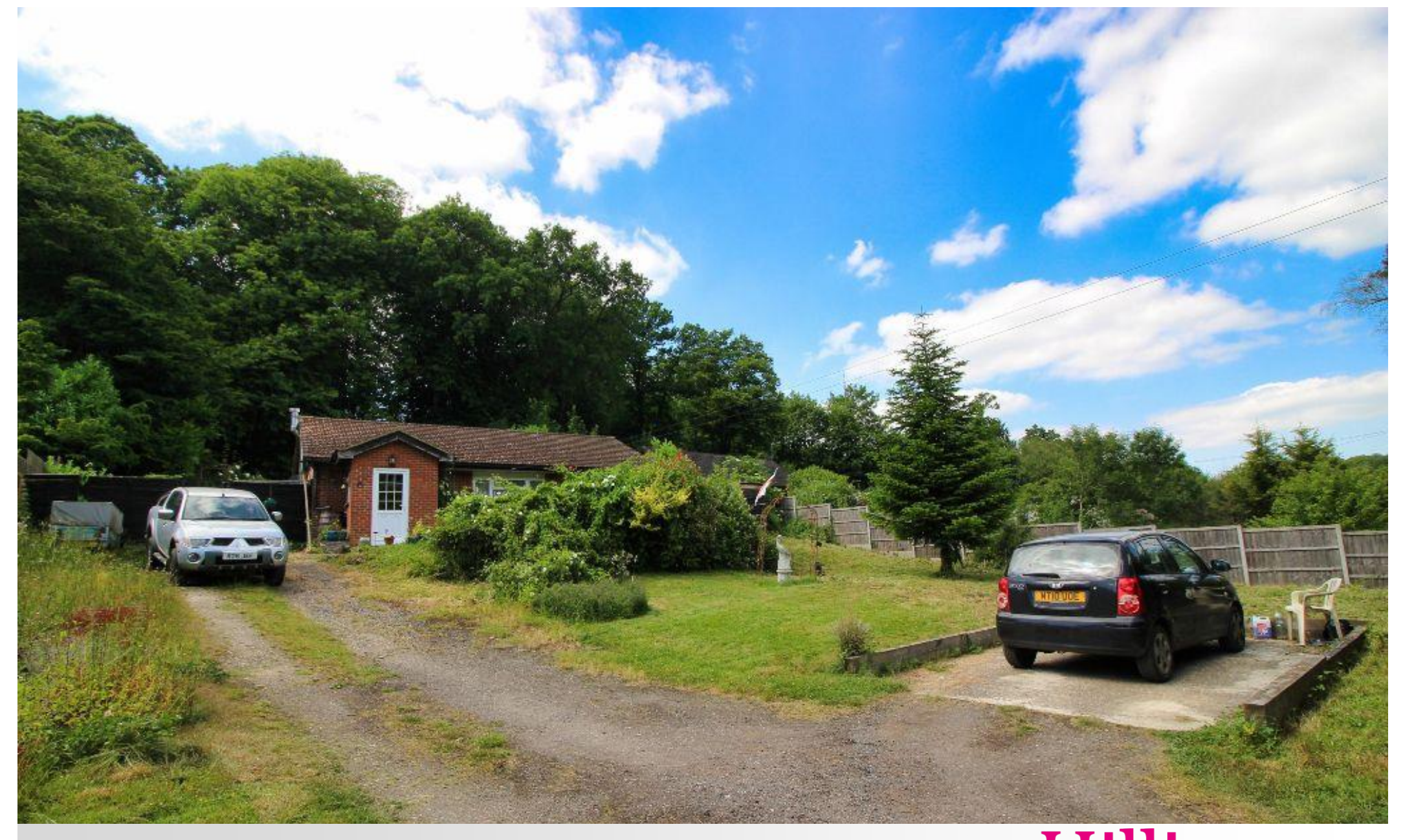
ROSINA, VALLEY ROAD, MEOPHAM, KENT, DA13 0DG