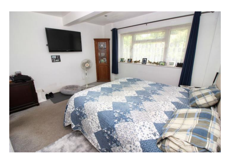
This 2 bedroom detached bungalow is found in a rural location in between the villages of Harvel and Vigo near Meopham.

The home sits on plot of just under a third of an acre so offers plenty of potential for extension and change like so many of the neighbouring houses in the lane. All subject to the usual permissions etc.