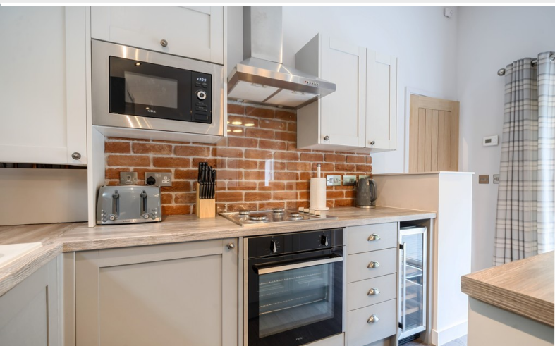
Open Plan Sitting Room / Dining Kitchen