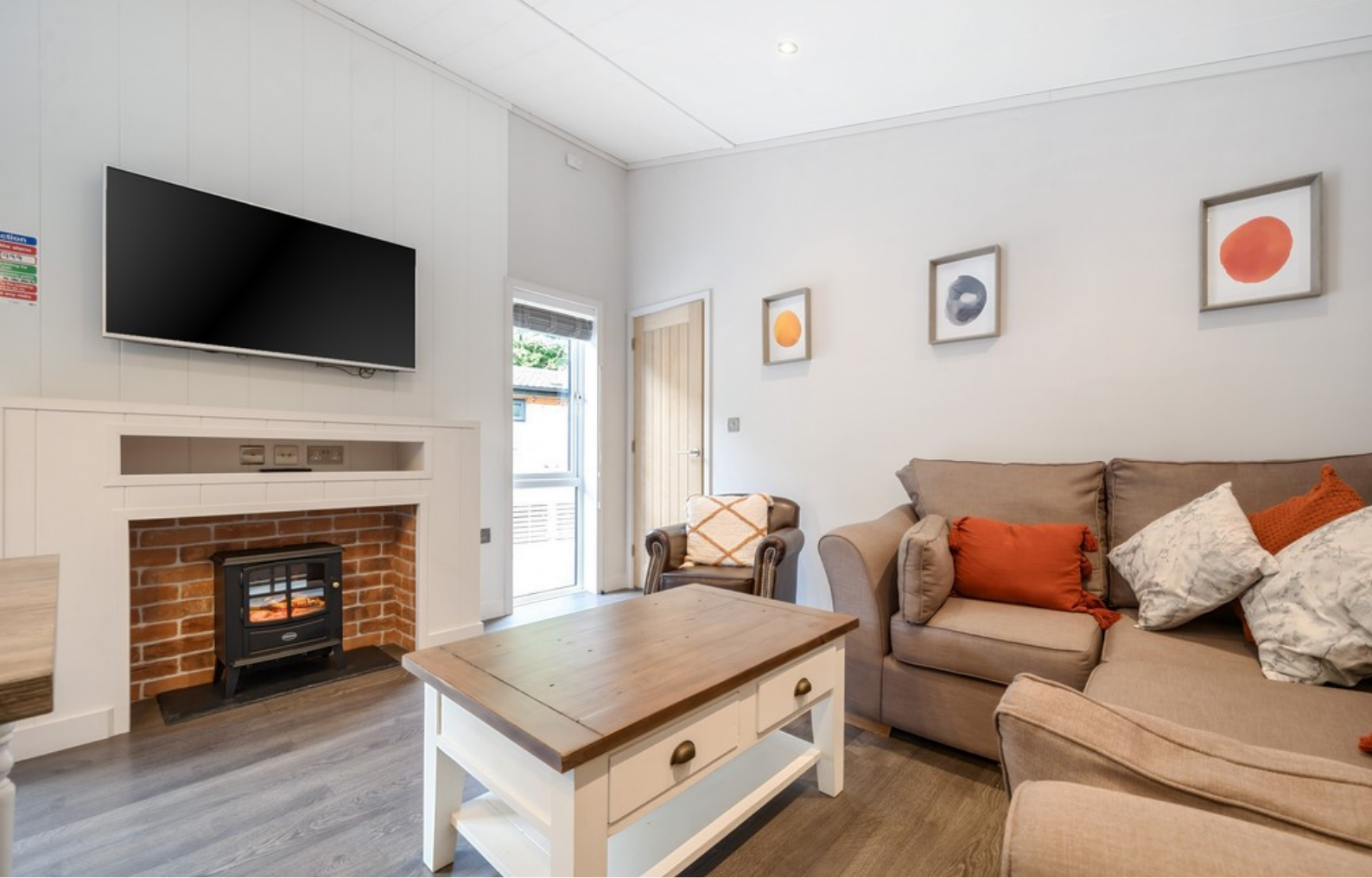
Open Plan Sitting Room / Dining Kitchen