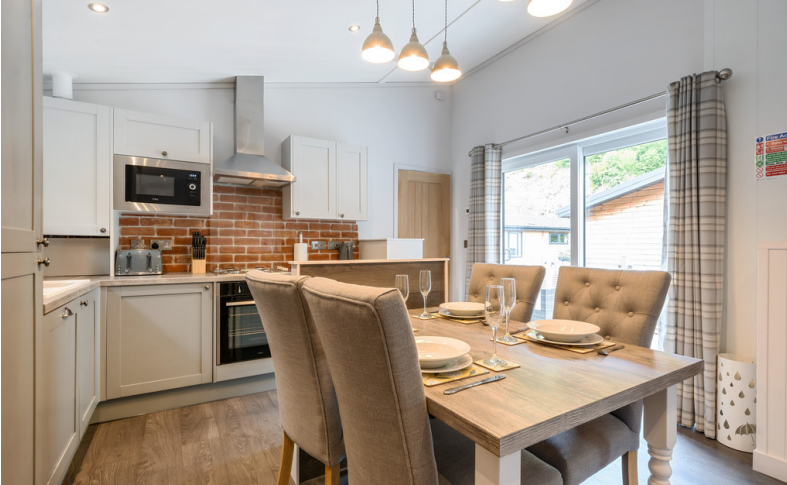
Open Plan Sitting Room / Dining Kitchen