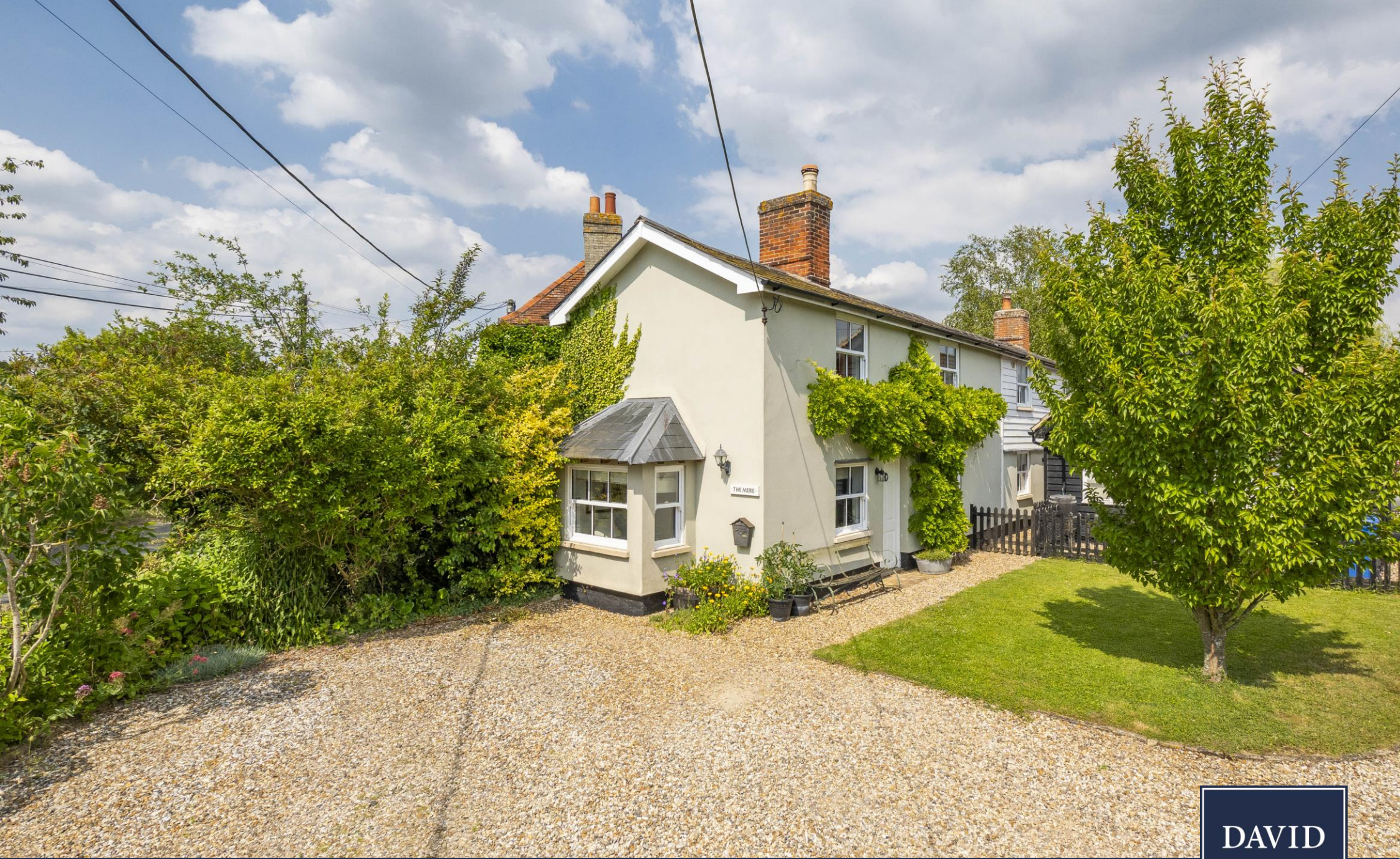
The Mere, Bures Road, Little Cornard, Suffolk.