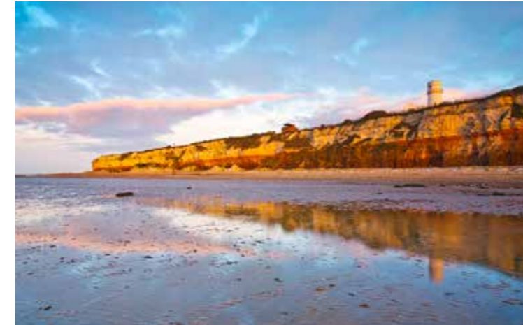
Hunstanton Beach and cliffs.

“With just a short stroll to the beach, this is a very tranquil place to be.”