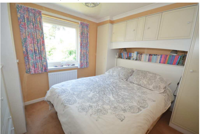
9' 5'' x 10' 8'' (2.87m x 3.25m) Fitted wardrobe & chest of drawers. Central heating radiator. Curved cornice.