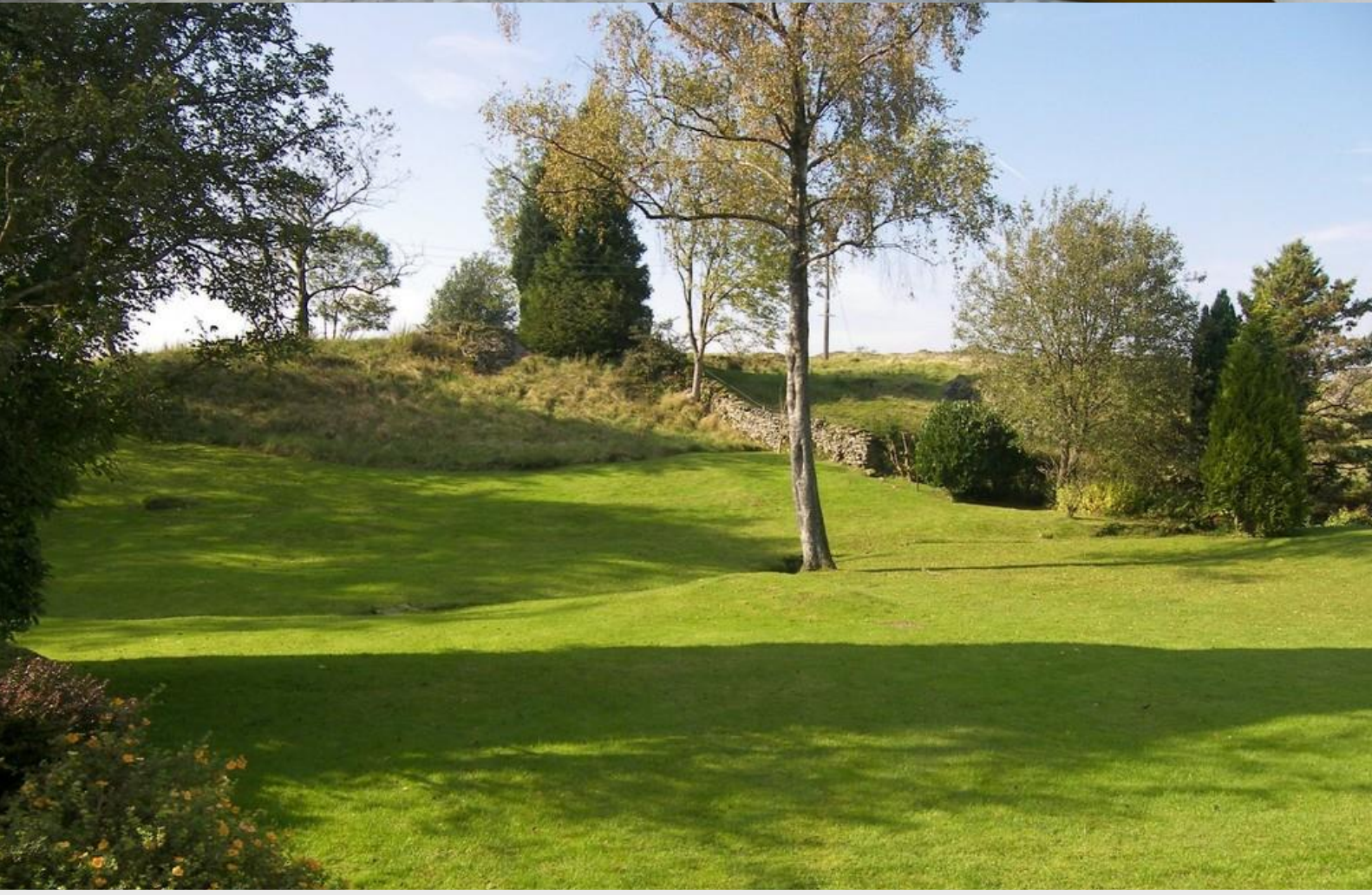
Rear garden area