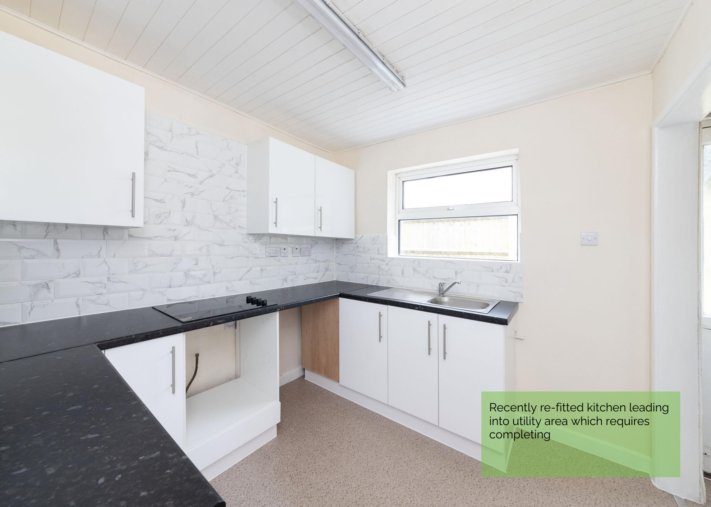
Recently re-fitted kitchen leading into utility area which requires completing