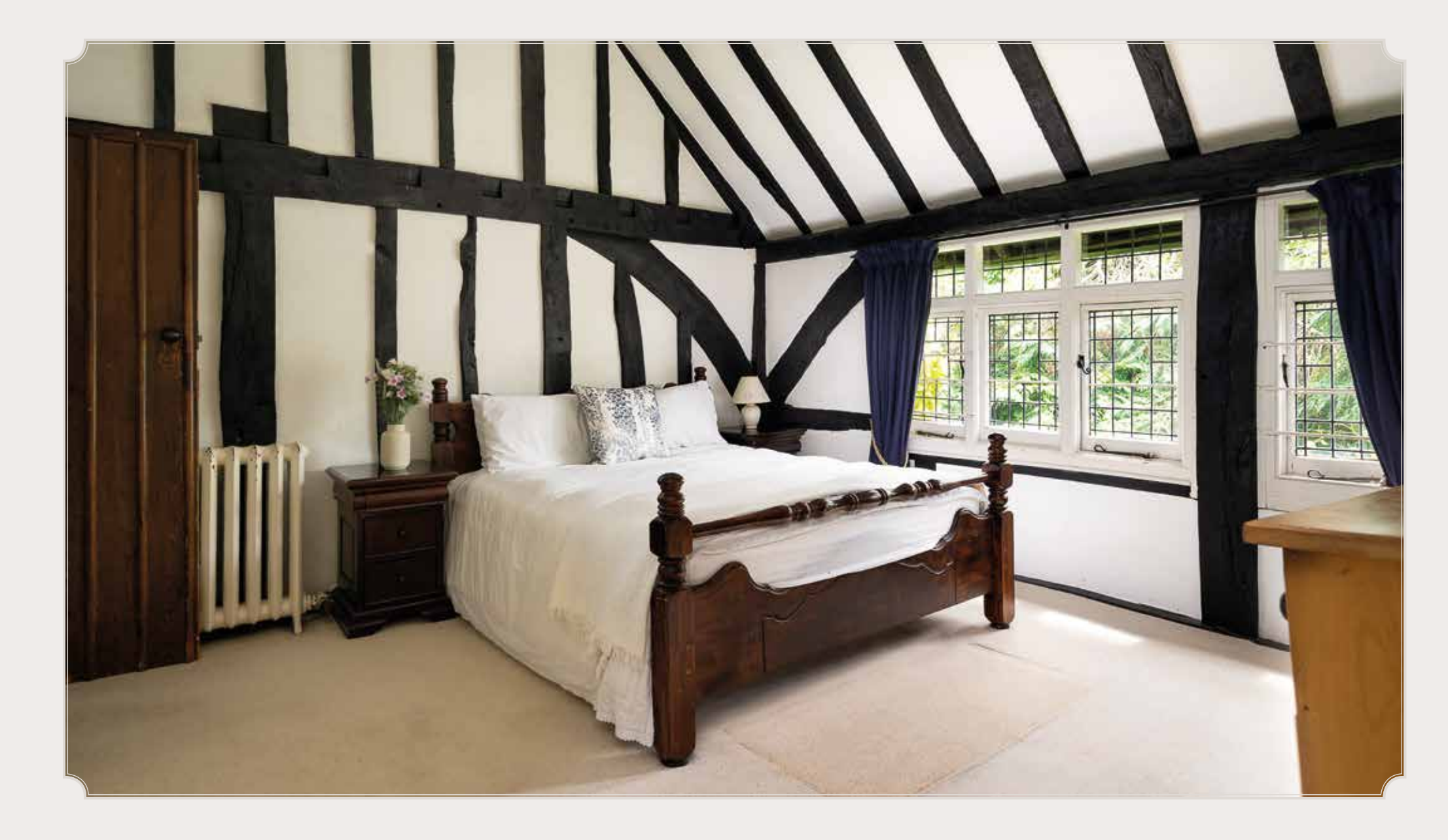
Next door, bedroom 2 is slightly larger and again has a vaulted ceiling, but this time the timbers have been removed creating a grand sense of height and space. The original beams in the walls show off their curves and curiosities and collectively contribute toward making this a truly delightful bedroom.

As you look back along the landing from the far end, the twists and turns and secret, semi-hidden linen cupboard spark yet more creative possibilities and intriguing theories about the various events this house has almost certainly witnessed in its lifetime. It's a fascinating space to be in.