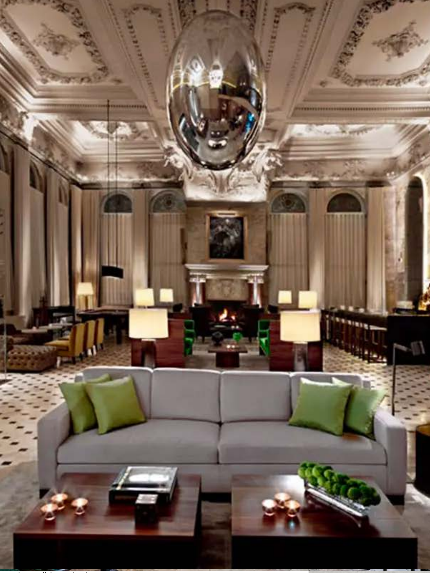
London Edition Hòte