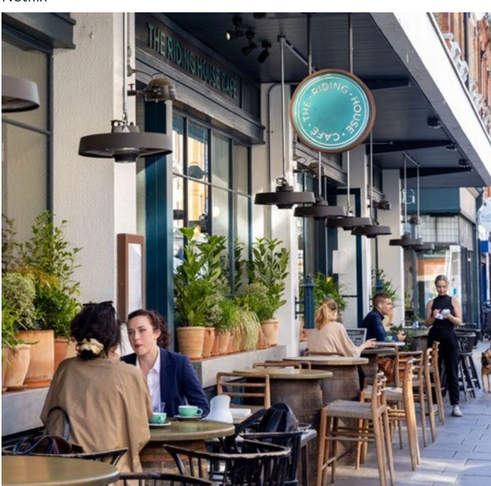
Riding House Cafe